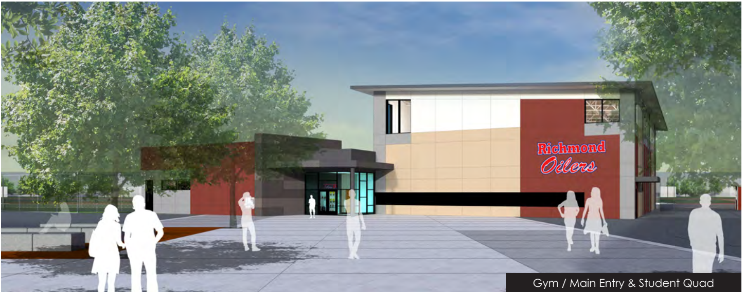
Gym / Main Entry & Student Quad