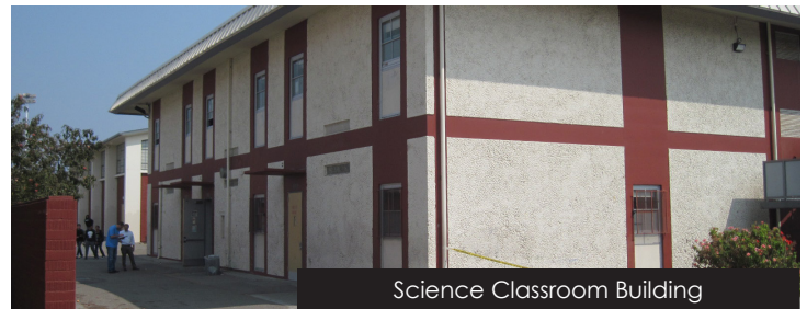
Science Classroom Building

This project includes a new practice gymnasium building which also includes a girls' locker room, dance studio, and weight room, as well as the seismic upgrade and accessibility retrofit of the existing Science Classroom Building. An exciting new element is the addition of a student quad between the two buildings and leading towards the entry of the stadium, which will provide a place to gather and a setting for outdoor learning activities. The project is being delivered using the design-build method.