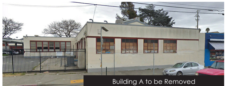
Building A to be Removed