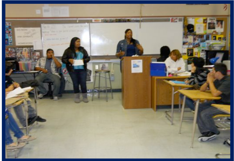
PVHS Health Center Youth Advisory Board Anti-Bullying Classroom Presentations 2011

Youth Advisory Board: The Health Center Youth Advisory Board help to envision and develop various ways of promoting health resources to the school and outside community as well as provide valuable information about the opinions, needs, wants and attitudes around Health Center services.