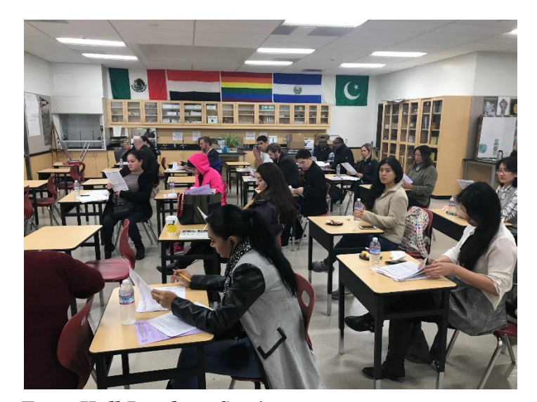
Town Hall Breakout Sessions