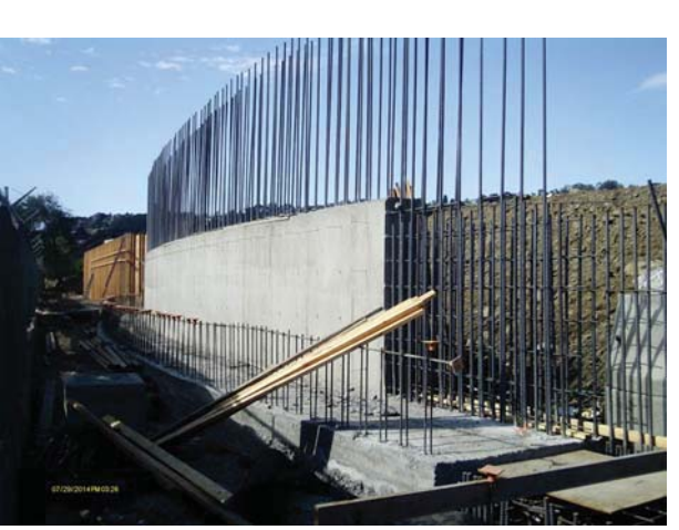
Ashbury retaining wall partial concrete pour