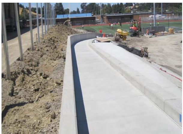
Plateau - Concrete Poured