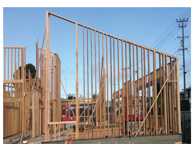
Building K Wall Framing