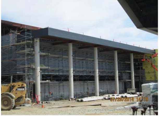
Building B - Pre-cast concrete column covers installation