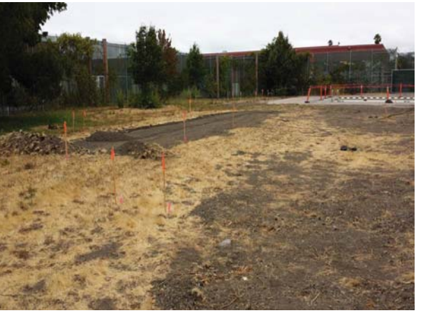
Pump House Pad Layout