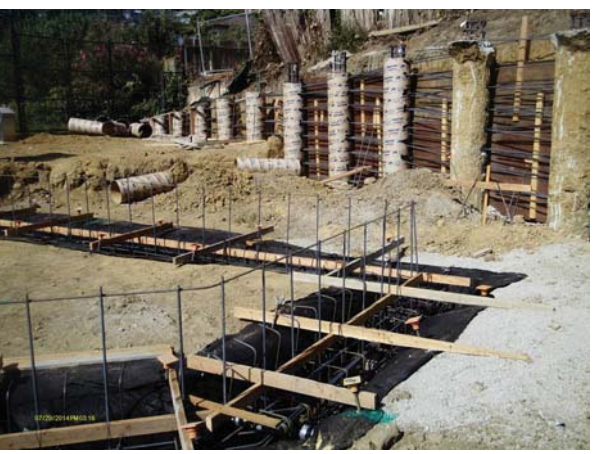
Building B footing complete & retaining wall