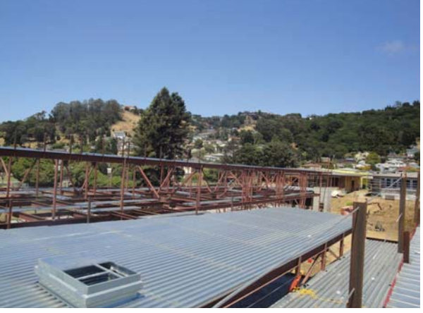
Building B Roof Metal Deck & Building C Structural Steel