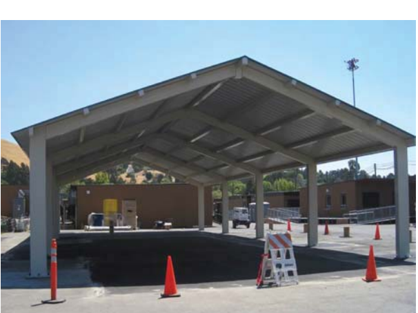
ion of Shade Structure