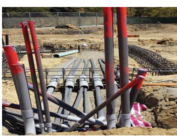
Electrical Stub-ups at Restroom Building