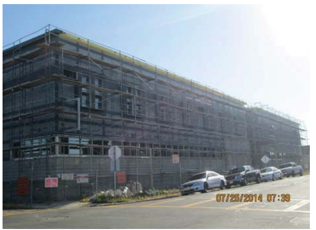
Building C - Rain screen at South side