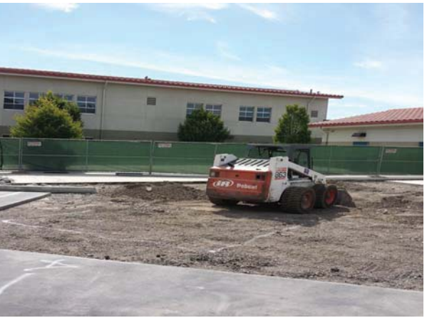
Recycling Center - Site Demolition-2