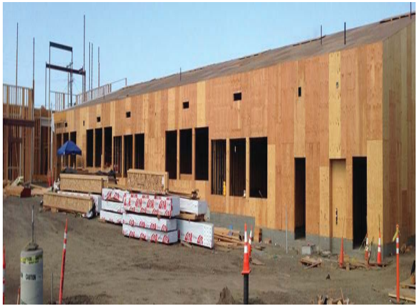
Building C Exterior Framing (West)