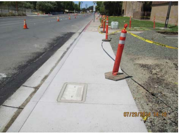
Finish Sidewalk at Library