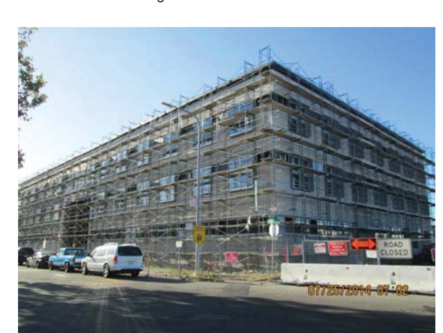
Building A - Plaster completed at west and north sides