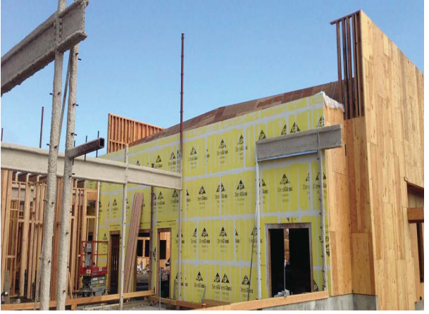
Building M Drywall Installation