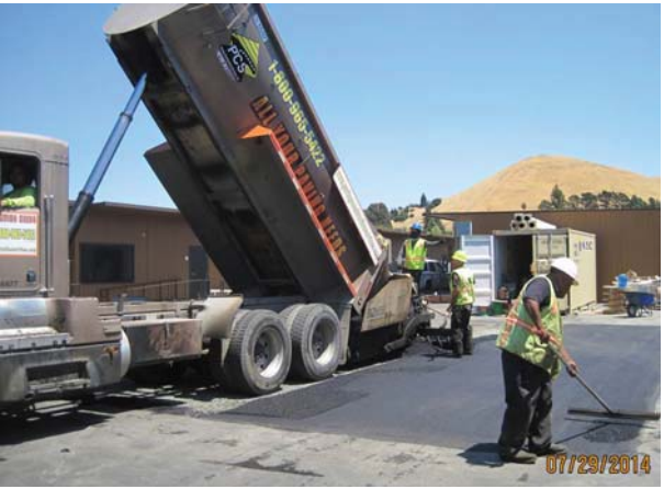
Campus - AC Paving