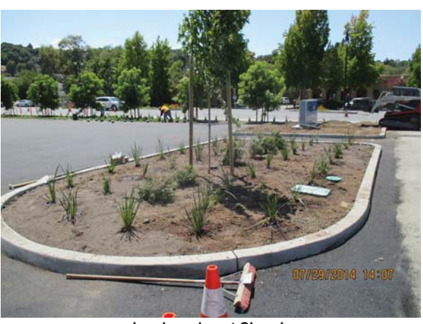
Landscaping at Church