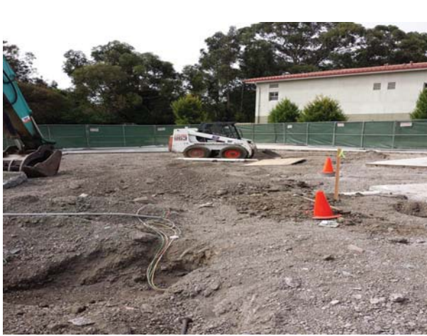
Recycling Center - Site Demolition-1