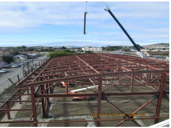
Building B - Steel Erection South Side