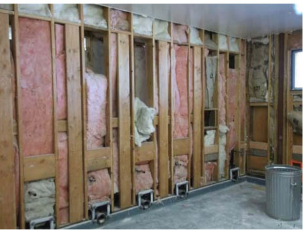
Downer Restroom Demolition - IN PROGRESS