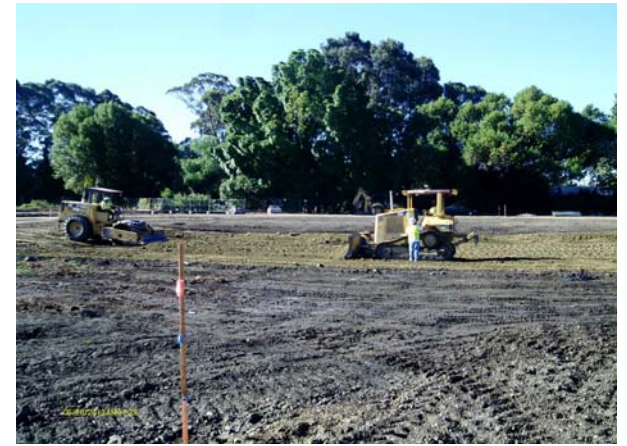
Chlordane pit has been backfilled and ready for non expansive soil.

Concrete retaining wall at Road 20 complete with drain rock.