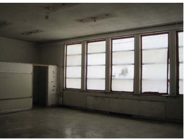
Typical Classroom with Trims Removed