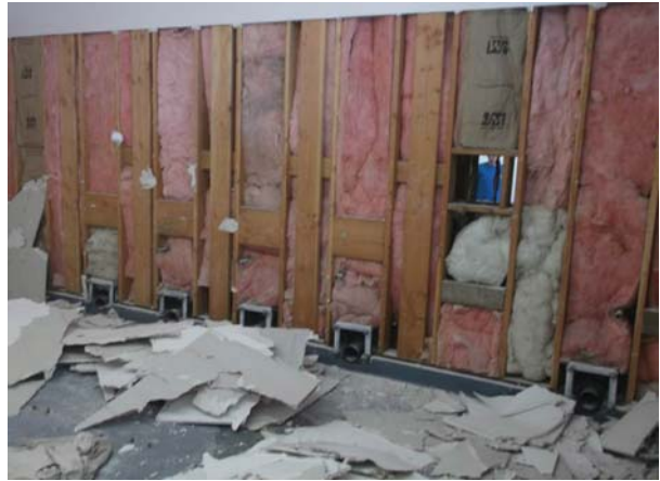
Downer Restroom Demolition - IN PROGRESS