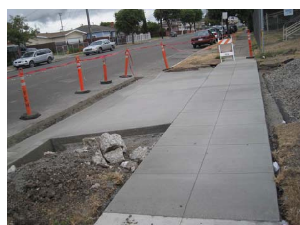
Main Construction Entrance Concrete Pour

To minimize disruption to neighboring schools, building demolition is scheduled to commence on July 15th when schools are off for the summer.