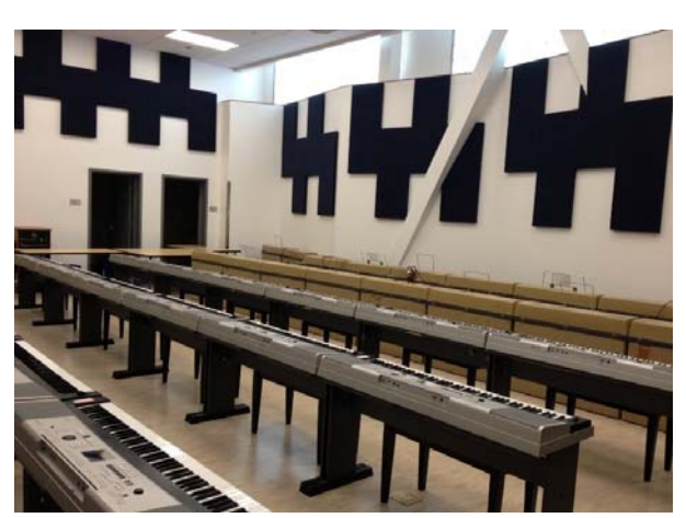
Building No. 2 - Music Room