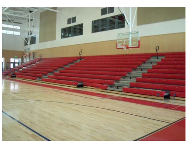
De Anza HS- Main Gym - Bleachers