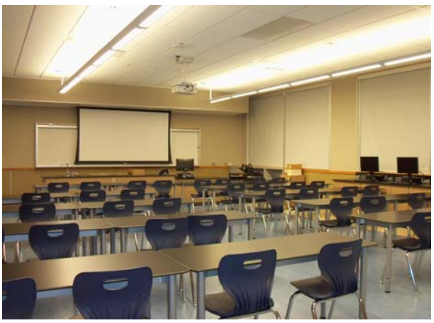
Building No. 5 - Science Classroom