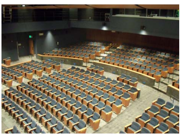
Building No. 2 - Theatre Seating