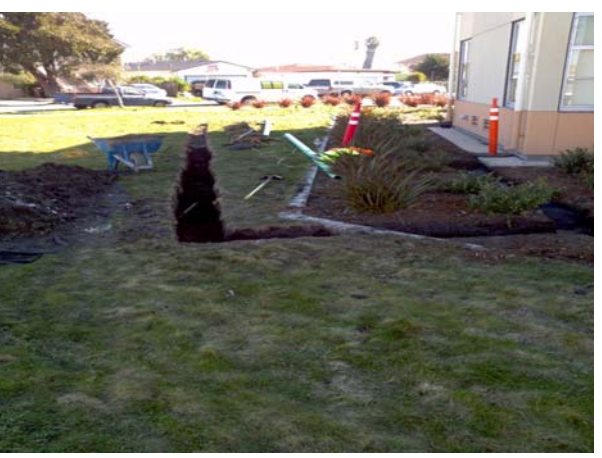
Trenching to existing DI and storm water pipe

Trench and filter fabric at North side of Campus