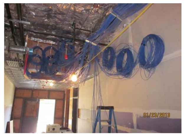
Ductwork in Building A