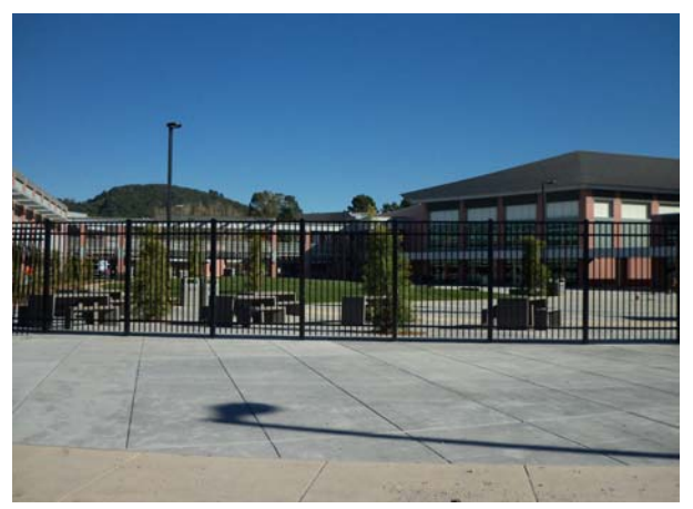
Site Work - Ornamental Fence