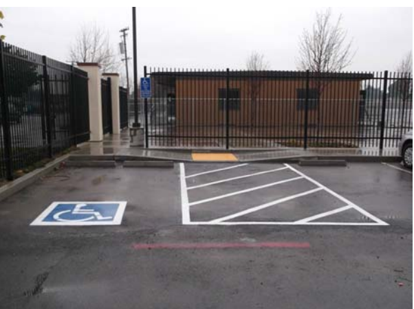
CCS @ Downer Portables, Fencing, Ramps - COMPLETE

CCS @ Downer- ADA Parking & Gate Opening - COMPLETE