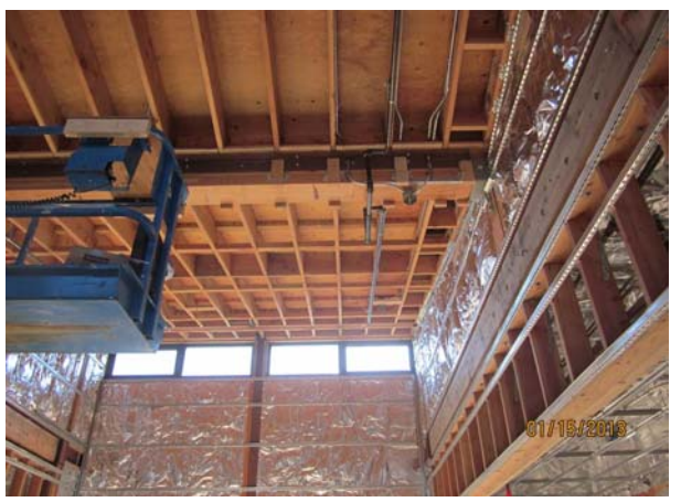
PG&E Joint Trench for Gas & Power

Clerestory Window Installation on Building B