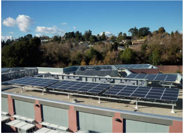
Building No. 3 Roof - PV System Panels