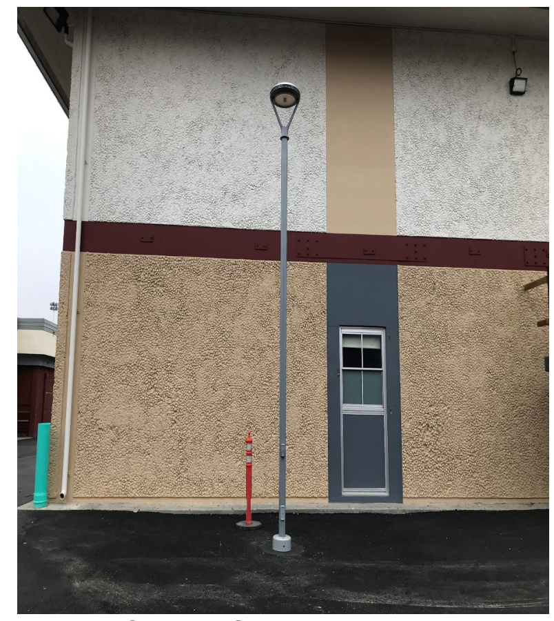
Science Quad Lighting