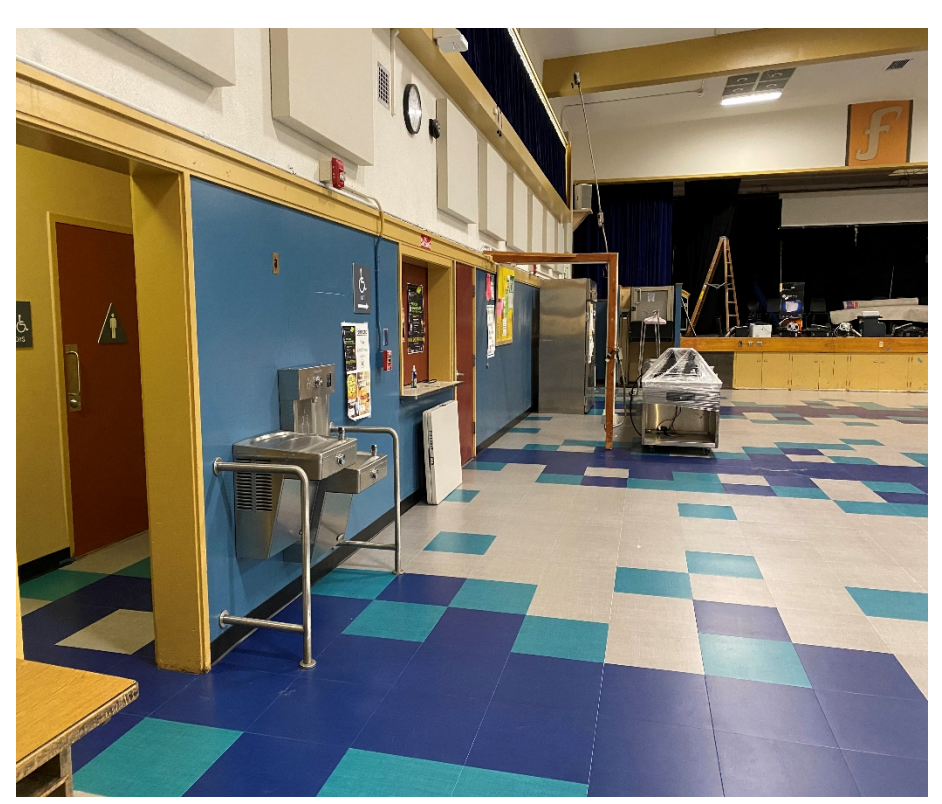
Multipurpose Room Flooring