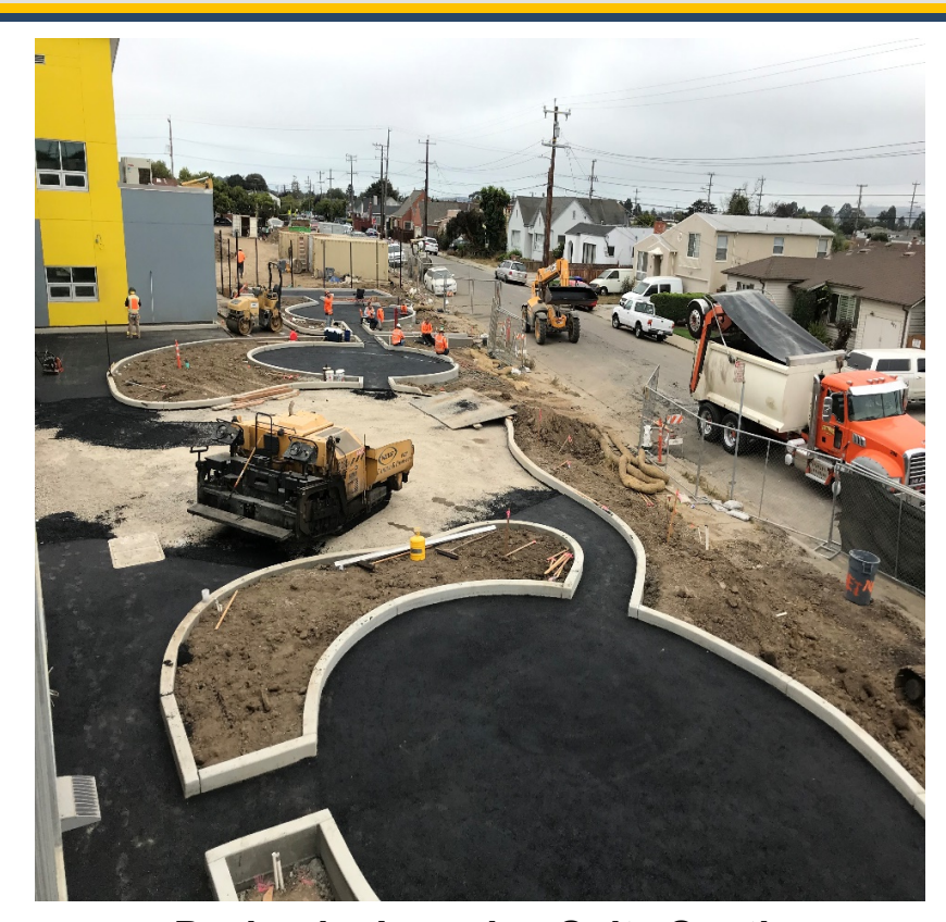
Paving by Learning Suite South