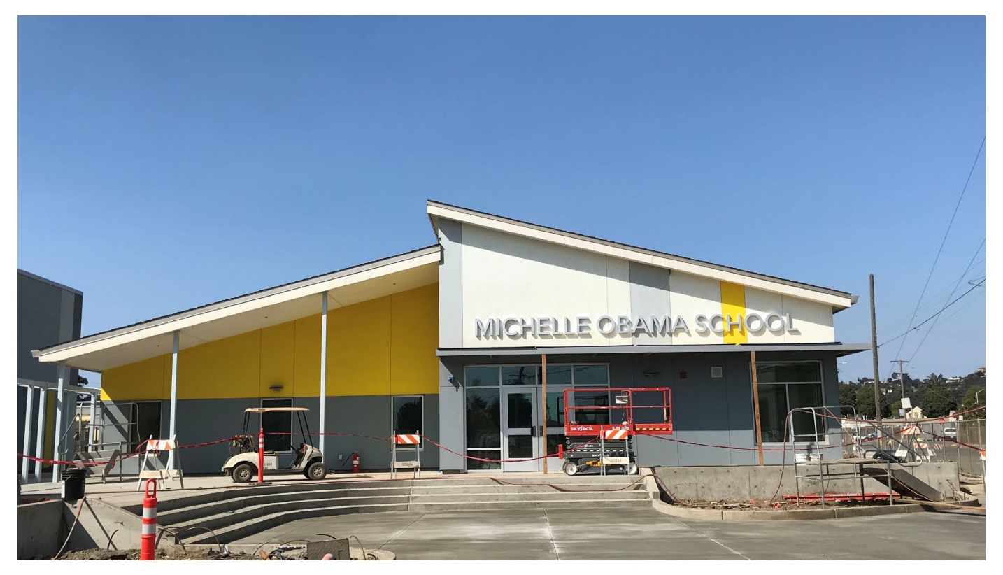
Administration Building Letter Signage