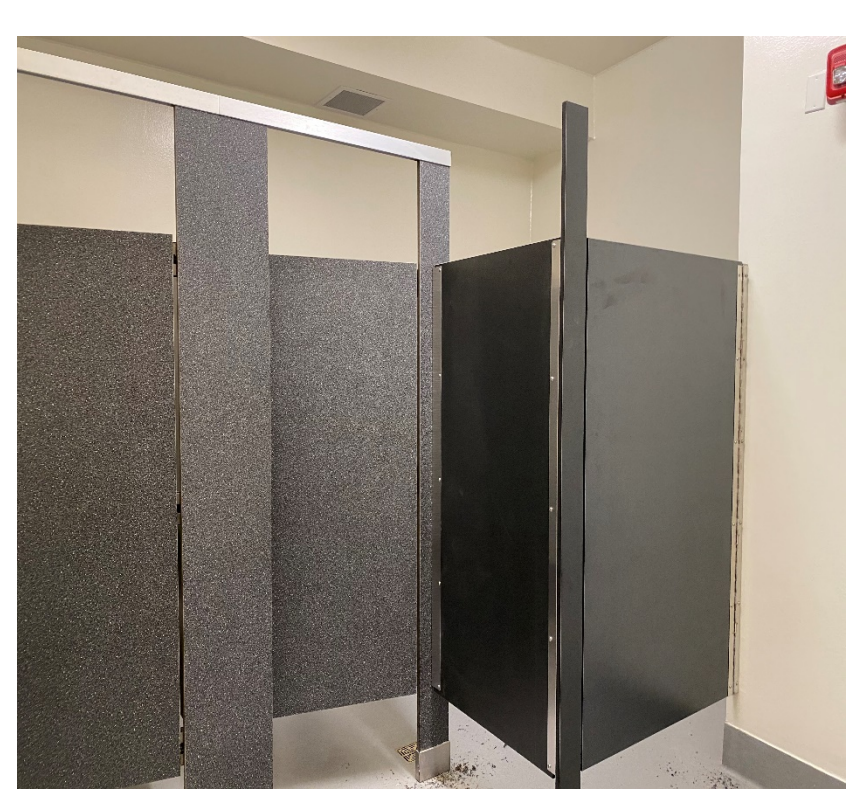
Student Restroom ADA Partition