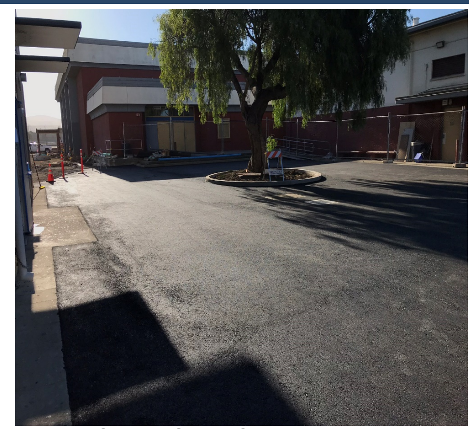
Science Quad AC Paving