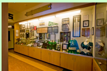
Old and new, updated pictures of ECHS.