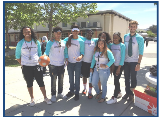
Hercules High School Health Center's Youth Health Workers.