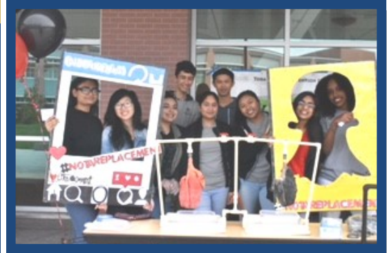
De Anza Health Center's TUPE Members