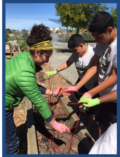
Crespi Middle Community School Garden

The Crespi Middle School Wellness Center was established during the 2016/17 school year in collaboration with the YMCA of the East Bay as a part of the West Contra Costa Unified School District's Full Service Community School initiative. The Wellness Center provides students with the support needed to face the challenges in their lives while working closely with faculty, administration, parents, and community to build a strong and positive school culture and support success for all students.