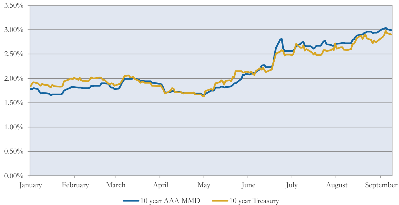
10 year AAA MMD and 10 year Treasury rates in 2013