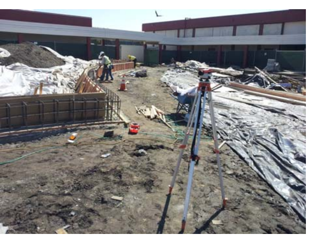
Seat Wall Forming at East Wall Quad