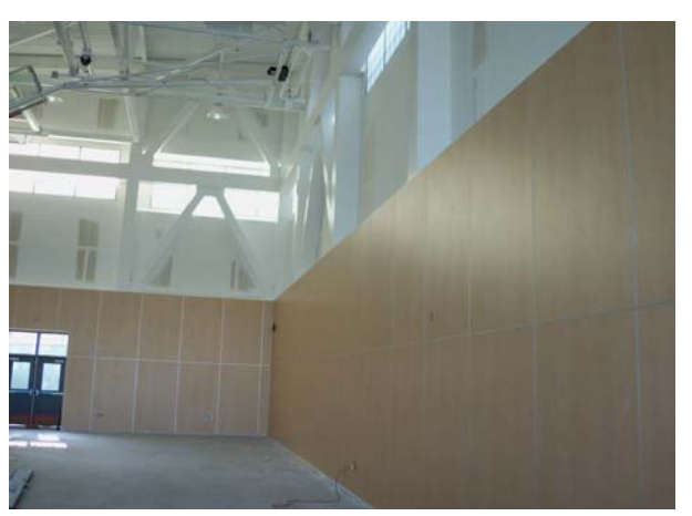
Building 8--Gymnasium: Interior Finish