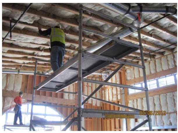
Building B - Insulation Activities