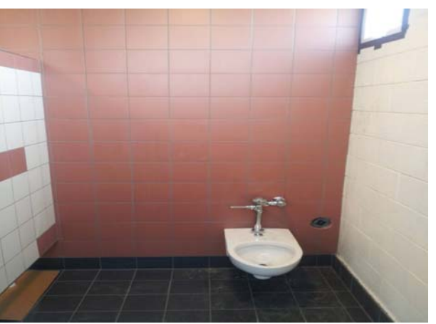
Men's Bathroom Stall