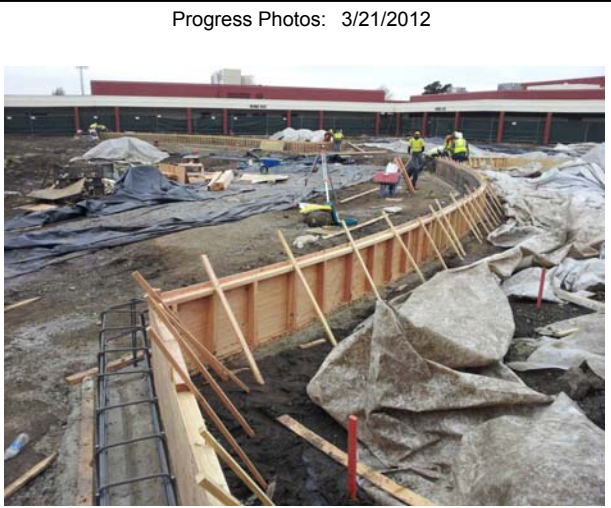
Seat Wall Forming at West Main Quad