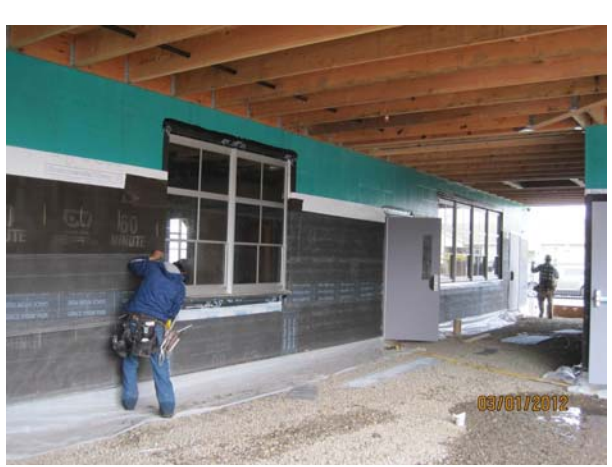
Building B - Vapor Barrier, Building Paper & Lath