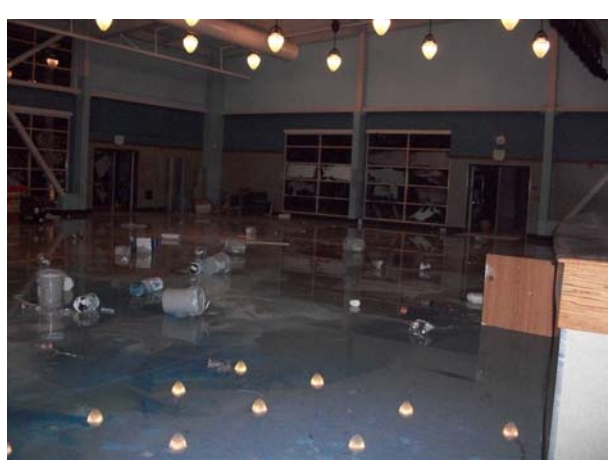
Vandalism in Multi-Purpose Room