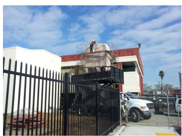
Elevator Roof Construction