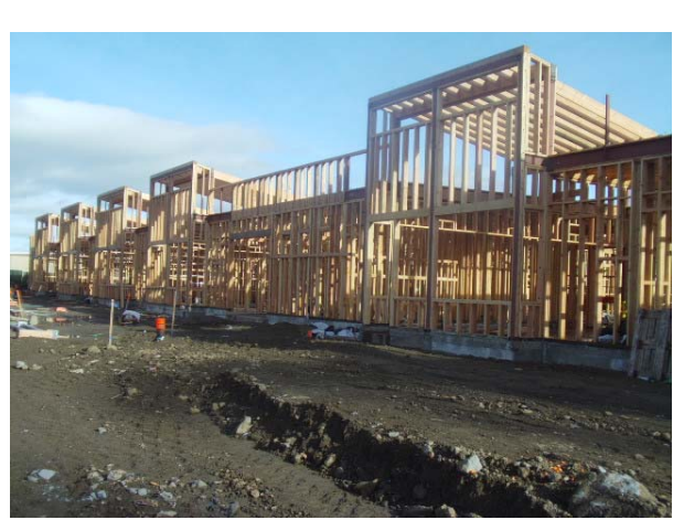
Rough Framing at Building B