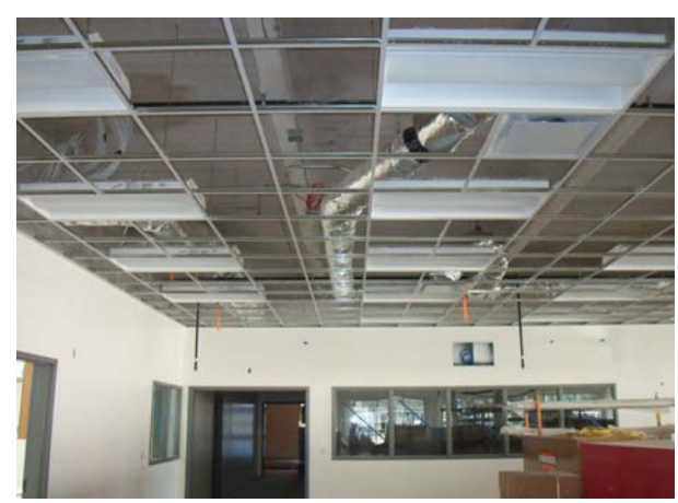
Building 1--Administration: Ceiling & Lighting