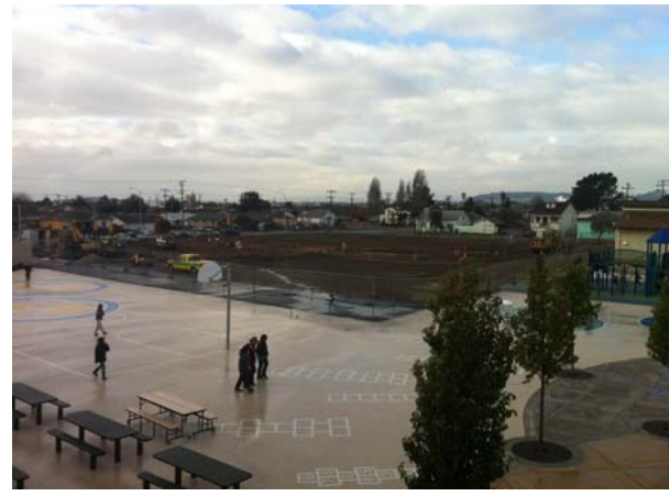
Overall Finish Grade Of Running Track & Play Yard