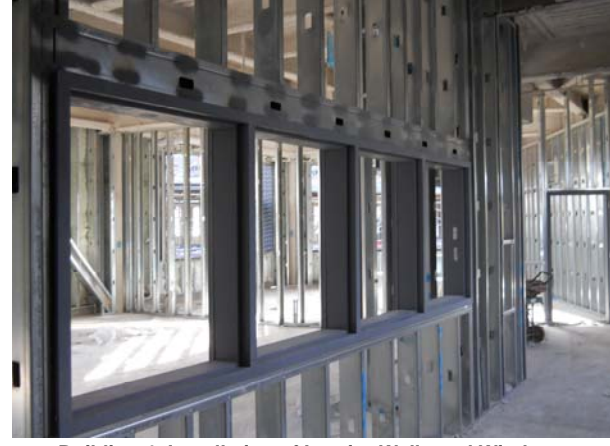
Building 4: Installation of Interior Walls and Windows