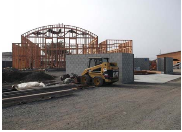
Building C - Framing