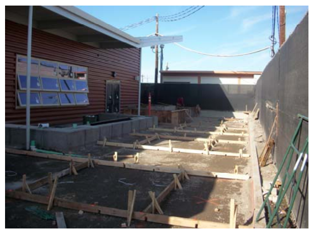
Forming for Flatwork