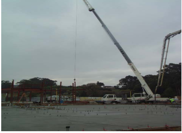
Crane Erecting Steel Columns at Building B