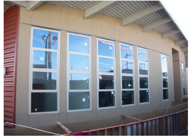
Radius Windows and Stucco Installation

On-going HVAC controls and start up activities. Units will be on in the library for building acclimation.