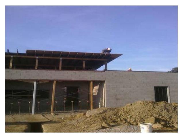
Concession Stand - Roof Plywood Covering