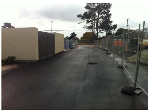
Installation Of Paved Access To Temporary Play Yard