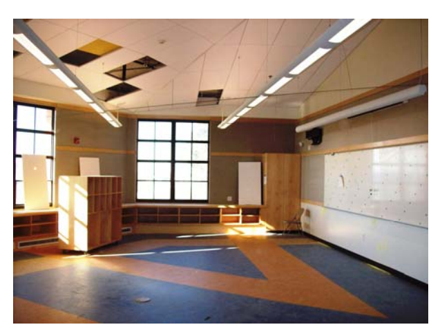
Area A, 2nd Floor North - Multi-Purpose Classroom