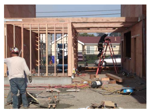
Building B - Construction of Low Roof