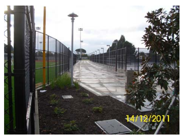
Fire lane/student access to field completed