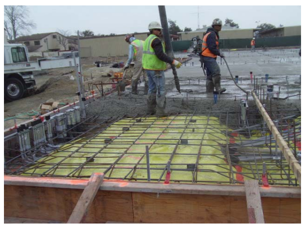
Concrete Pour for Slab on Grade at Building A