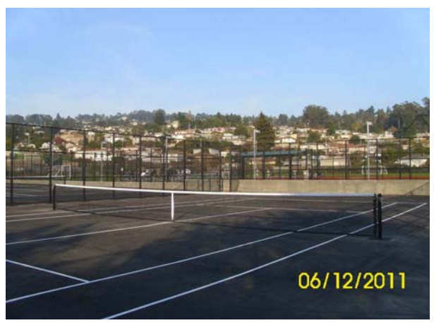
Tennis court temporary striping until warmer weather