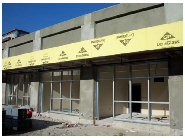
Building 1: Exterior Plaster Applied