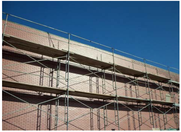
Building 2: Installation of Brick Veneer