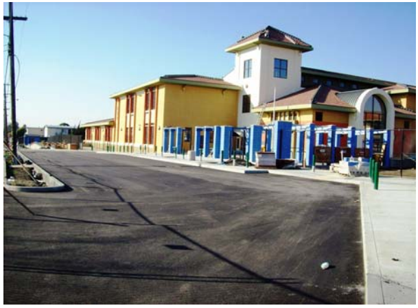
View from Entry to Maricopa Avenue Traffic Turnout

Progress continues toward late January Substantial Completion and Mid-February School Opening.