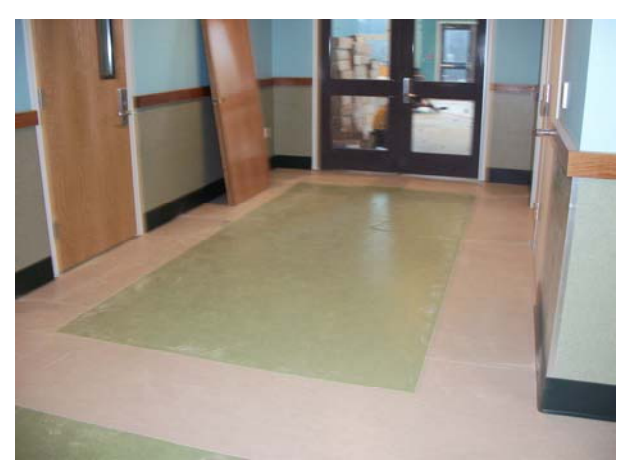
Linoleum Flooring in Hallway