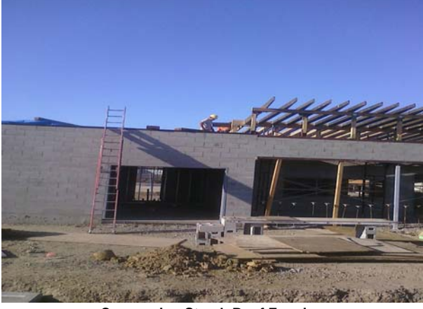
Concession Stand- Roof Framing