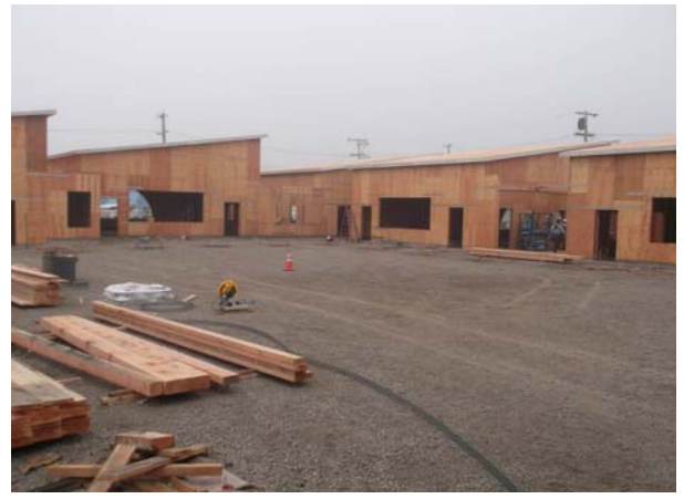
Building B - Shear Panel & Roof