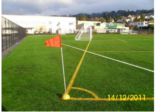
Multipurpose field has been turned over for Soccer team use.