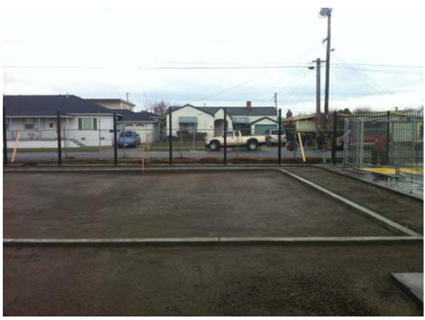
Finish Grade Of Pre-School Play Yard