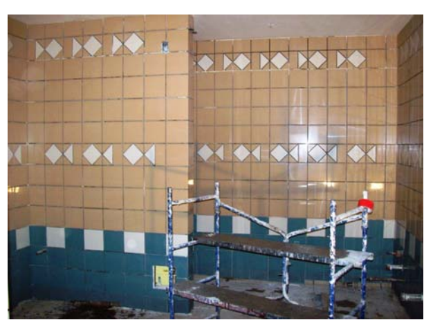
Bathroom Tile Finishes are Well Advanced