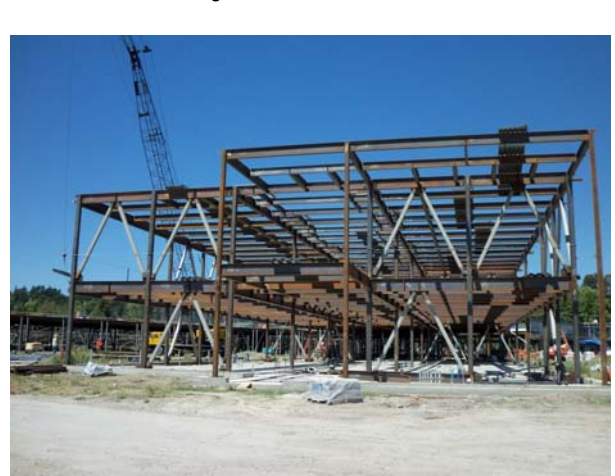
Building 7: Install Structural Steel