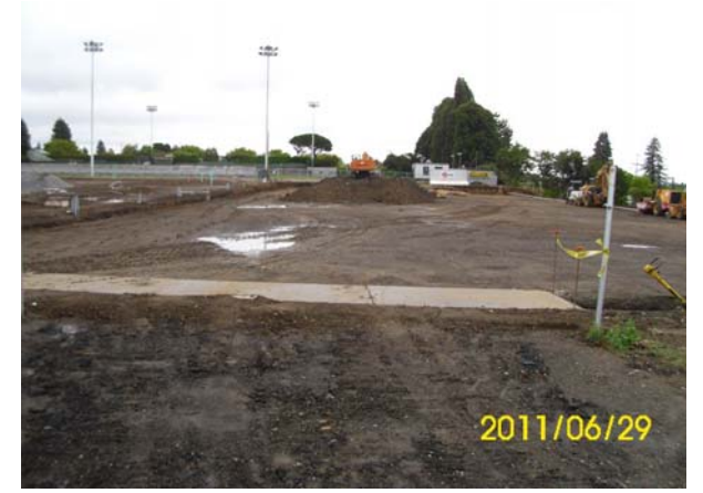
Existing access road removed and re-graded for tennis courts.