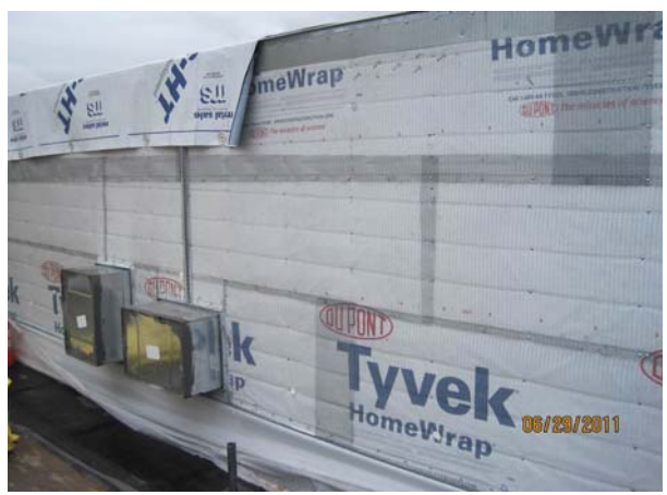
Tyvek & Chicken Wire at Roof Wall