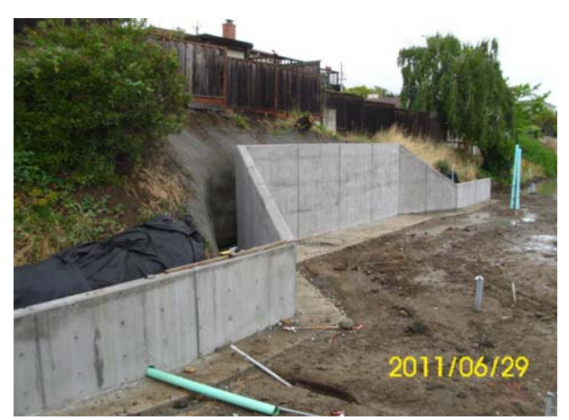
Main retaining wall complete behind baseball backstop