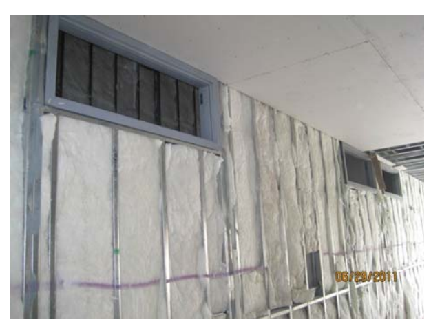
Framing, Insulation, Drywall & Window Frames

Weekly updates to adjacent LPS High and Nystrom Elementary school principals regarding upcoming construction activities - no foreseeable class-disruptive activities noted.