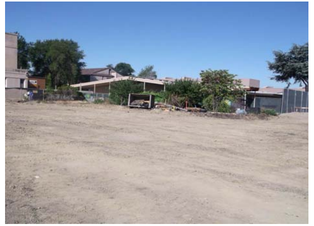
South Side of Site & Existing School Garden