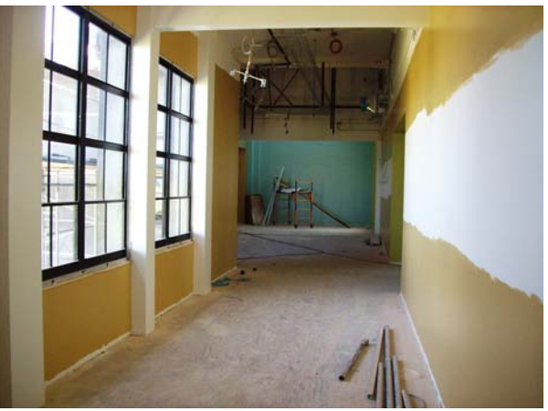
Interior Painting Nears Completion