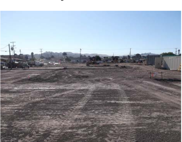
West Side of Site-Bldg. B & C Pad-COMPLETED