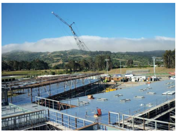
Building 6 & 7: Install Metal Roof Deck