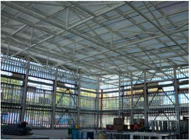
Building 8: Install Interior & Exterior Wall Framing