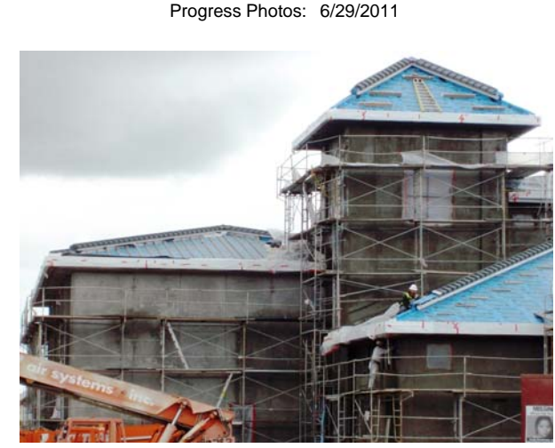
Stucco and Roof Construction Proceeds Well

Progress continues well toward completion during the Fall of 2011.