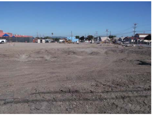
East Side of Site-Bldg. B & C Pad-COMPLETED