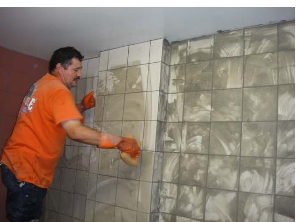
Grout work in coaches bathroom