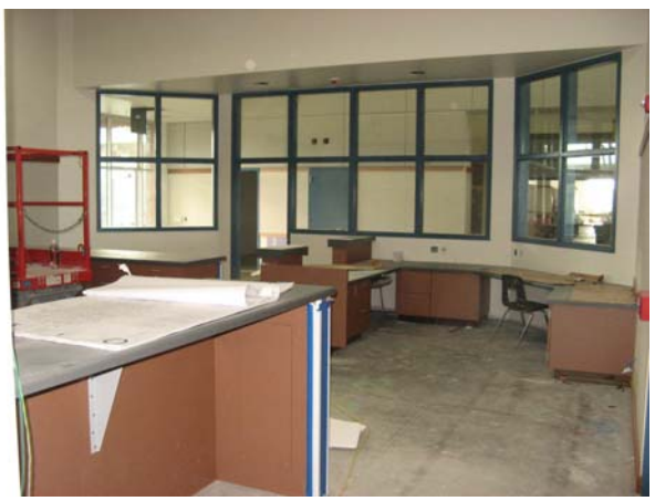
Bldg "A" (North) Installation of Interior Millwork