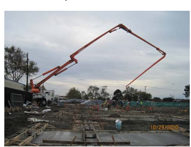
Footing Concrete Pour

Constant updates and interaction with adjacent LPS High and Nystrom Elementary school principals regarding upcoming construction activities.