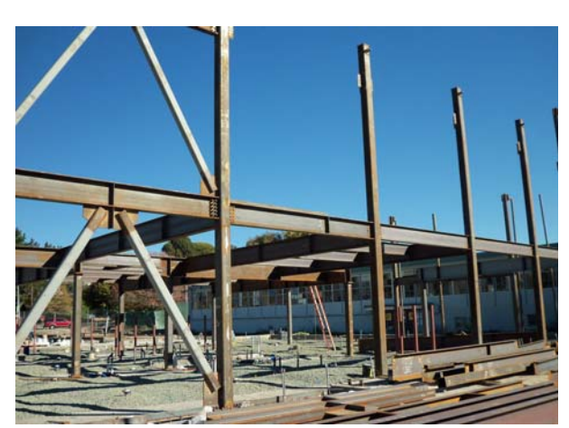
Building 8 Erect Structural Steel