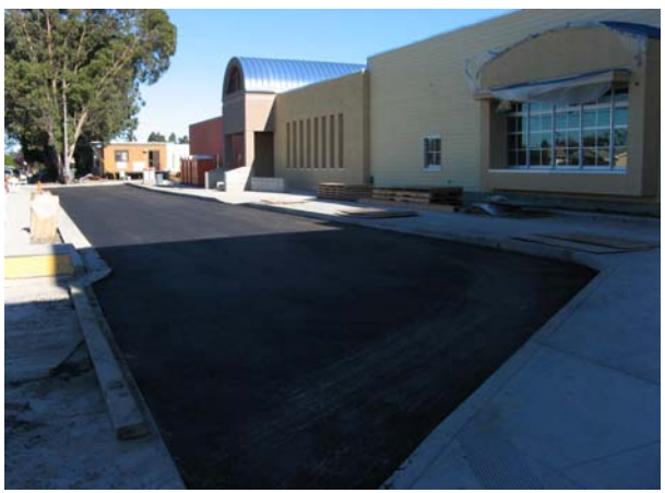
Bldg "A" New Curb, Sidewalk, Ramps, and Drop Off