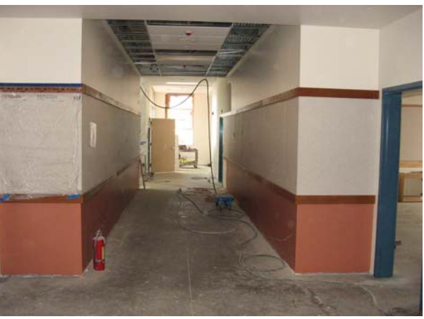
Bldg "A" (North) Corridor with Paint, Panels, and Trim