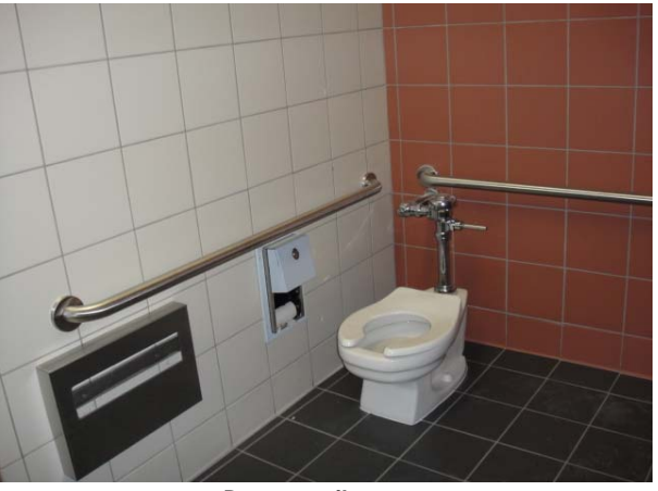
Daycare toilet room