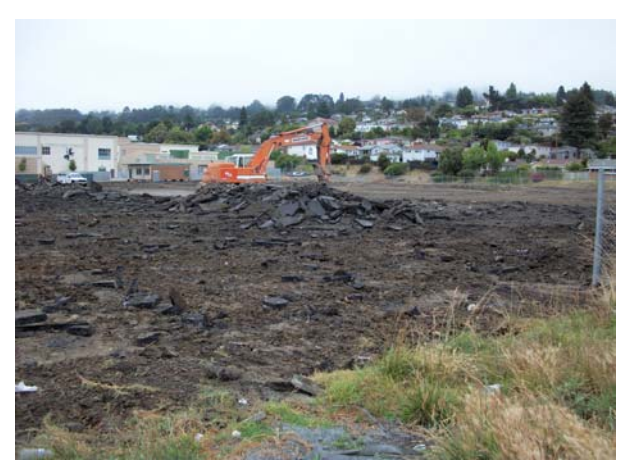
Temp Campus Asphalt Removal