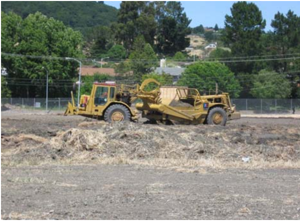
Site Clearing & Grub Removal