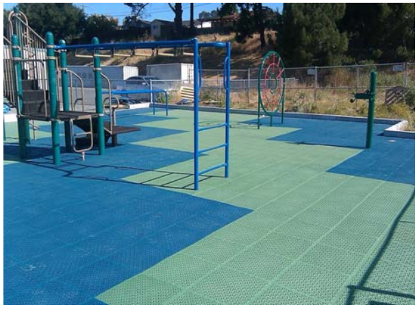
Valley View Structure - looking southeast

The final Safety Audits have been authorized and the work is expected to be completed within the month of July.