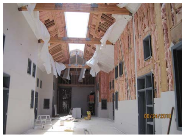
Building B 2nd Floor: Gypsum Board at Walls