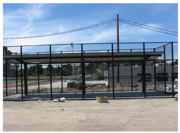
Installation of New Shade Structure