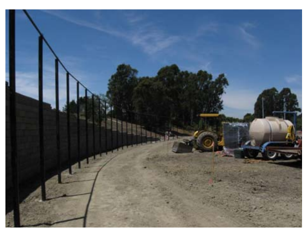
Installation of New Fencing and Backstop