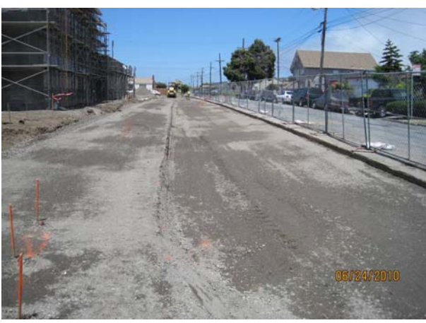
Site: AB for Sidewalk & Drop-off