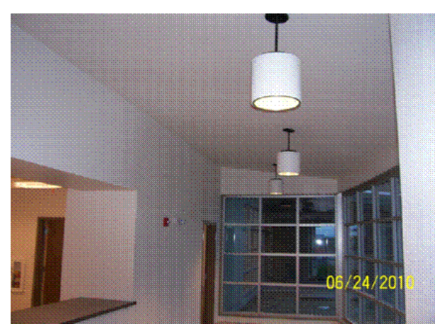
Main Lobby w/Storefront Windows & light Pendant Fixtures