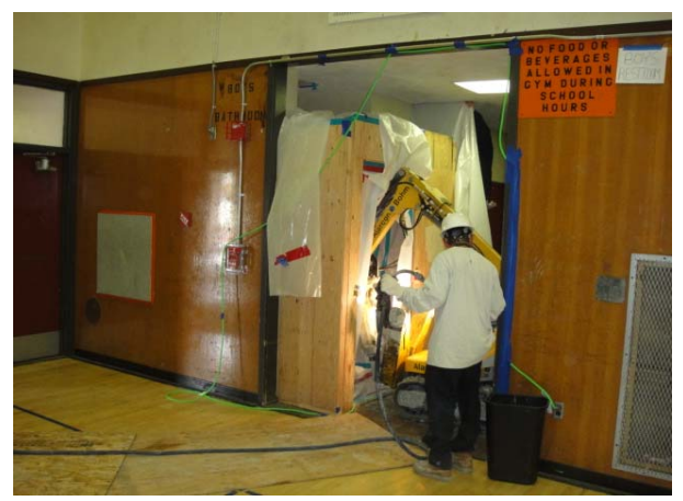
Mobile Jackhammer - Boy's Gym Bathroom