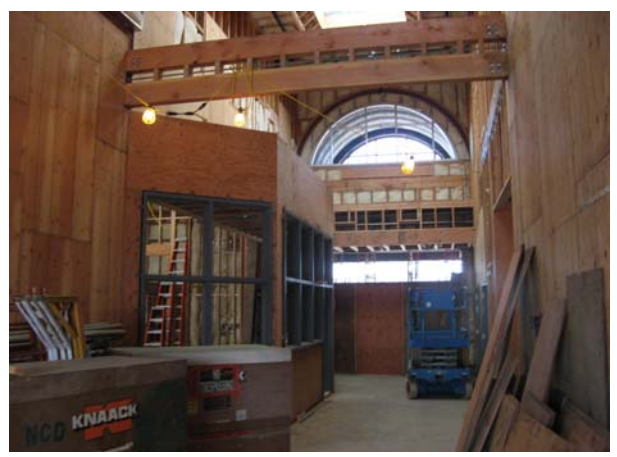
Bldg "A" (North) Install-Door/Window Frames & Insulation