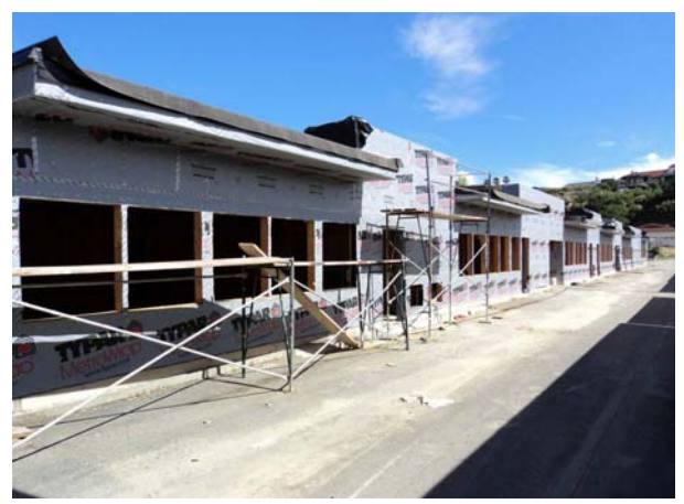
Stucco underlayment installation