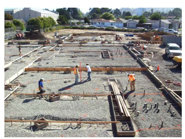
Areas B; Dressing of Base Rock for Slab-On-Grade Underway