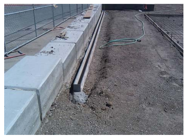
Foundation Walls & Drain at Quad Court Yard

The work is proceeding well. Due to a late start, a project non-compensatory time extension has been requested.