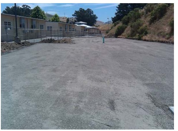
Final Grading of Teacher's Parking Lot