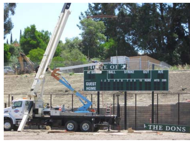
Installation of New Scoreboard