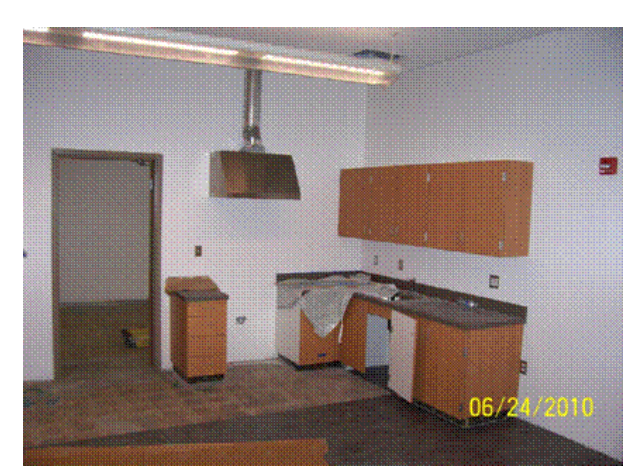
Teacher's Lounge w/Casework and Flooring