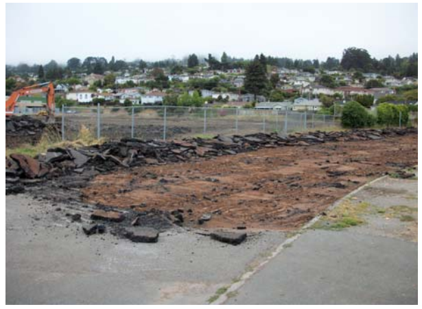
Asphalt Removal at Basketball Courts