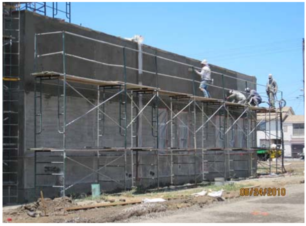
Building A East: Stucco - Brown Coat