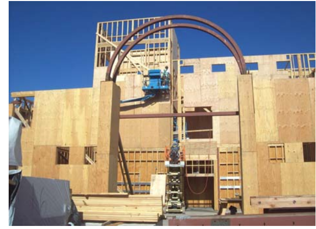
Area A (North); Exterior Wall Sheathing Progresses

Study of formal Schedule Recovery is underway.