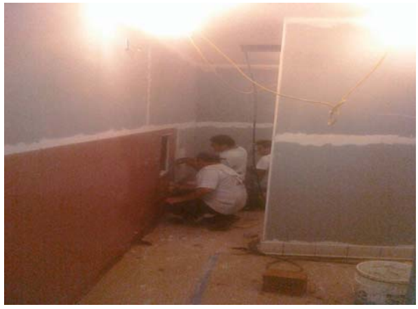
Ceramic Tiling - Women Coach's Office