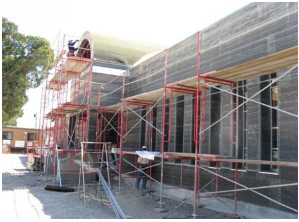
Bldg "A" (North) Installation of Lath for Plastering