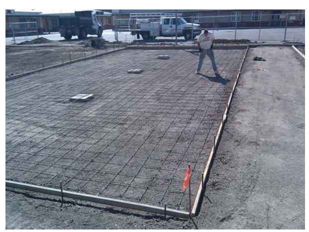
Volley Ball Court Slab in Quad Area