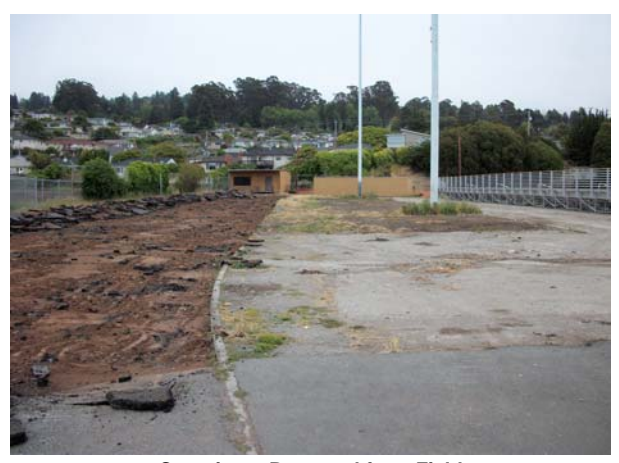
Containers Removed from Field