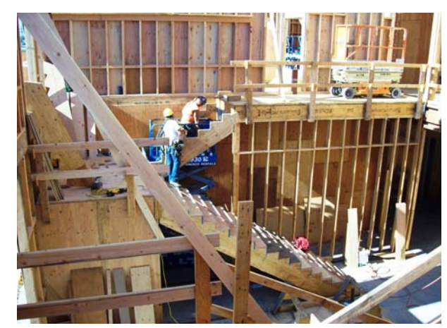
Area A (North); Stairway 2A & 2B @ Main Lobby Progresses