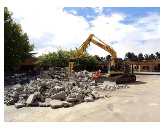
Main entrance demolition