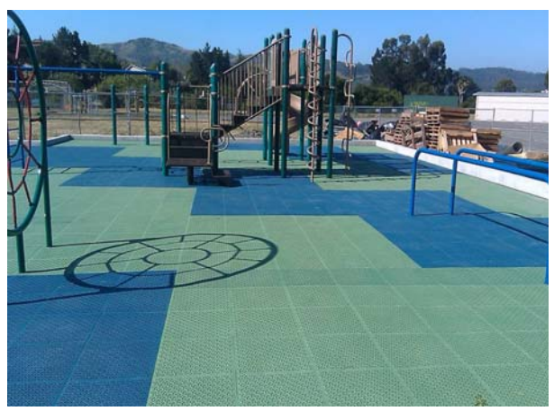
Valley View A - looking east