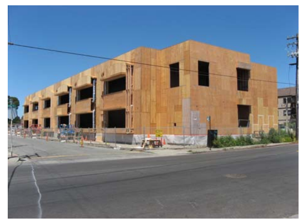
Bldg "A" (South) "Pop Outs" & Mech. Installation