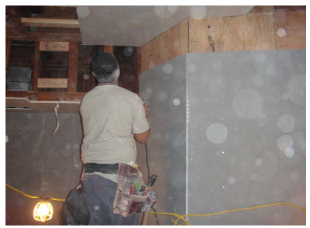
Drywall - A Bathroom