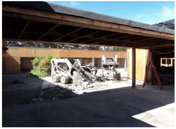
Court yard demolition