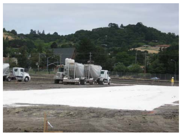
Lime Treatment of Building Pad