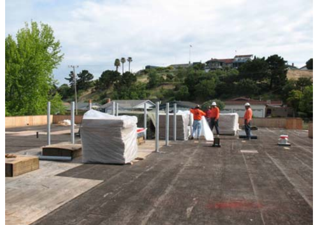
Loading roofing material on building A-1