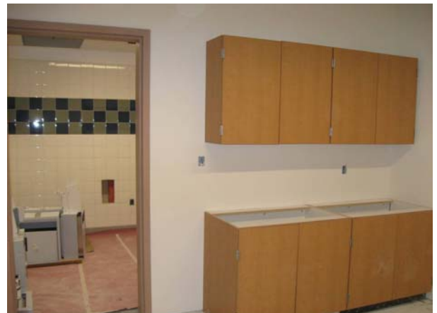
Casework and Restroom in Nurse's Office