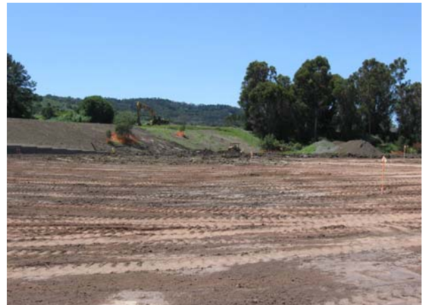
Site Earthwork and Field Layout