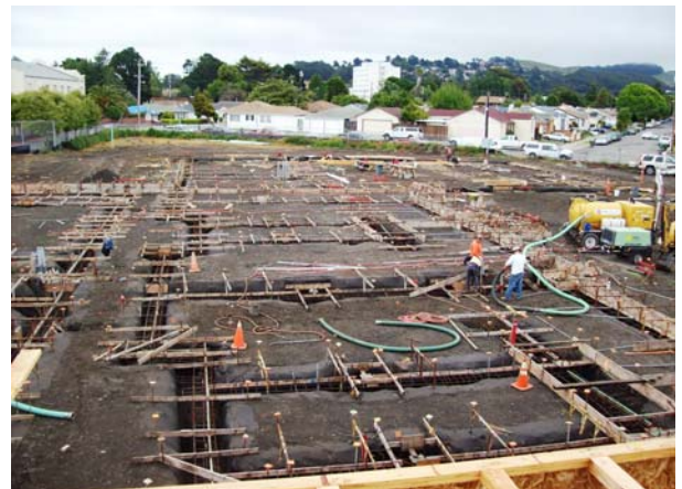
Areas B & C; Footing Development Underway Again