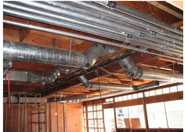
Mechanical and electrical installation building A-1