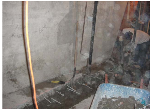
Slab Demo. Coach's Bathroom