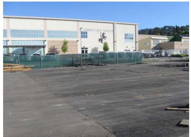
Prep for Excavation