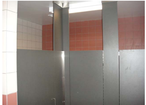
Completed Girl's Cafeteria Bathroom