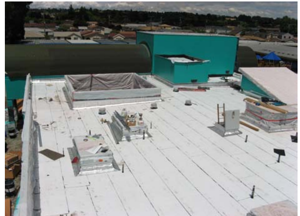
Bldg "A" (North) Roof Construction