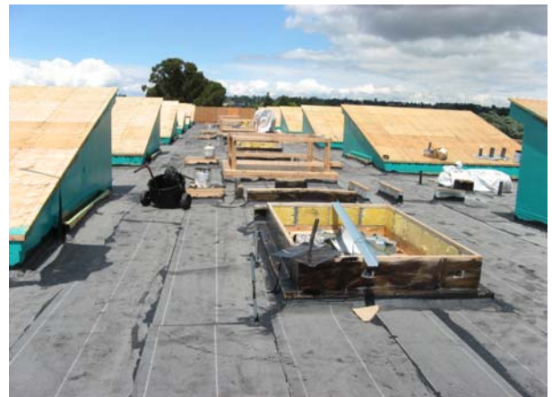
Bldg "A" (South) Roof Construction