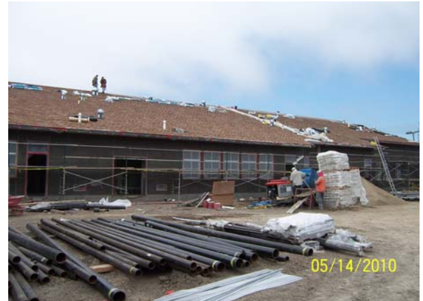
Building A: Asphalt Shingles South Side