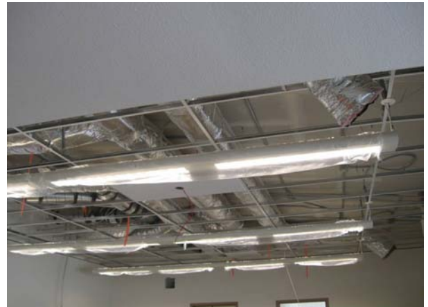
Light Fixtures/T-Bar Grid