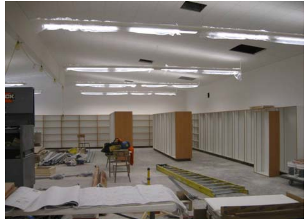
Casework in Book Room