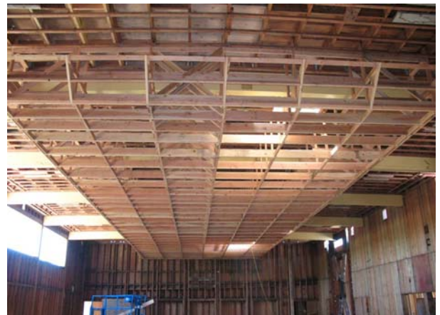
Soffit installation in Multi Purpose Room