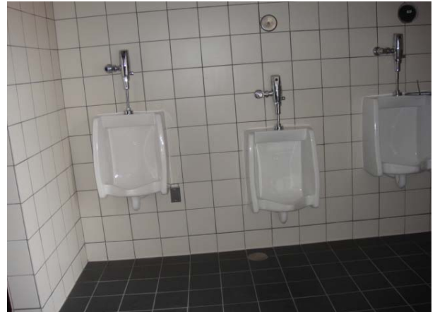
Complete Boy's Cafeteria Bathroom