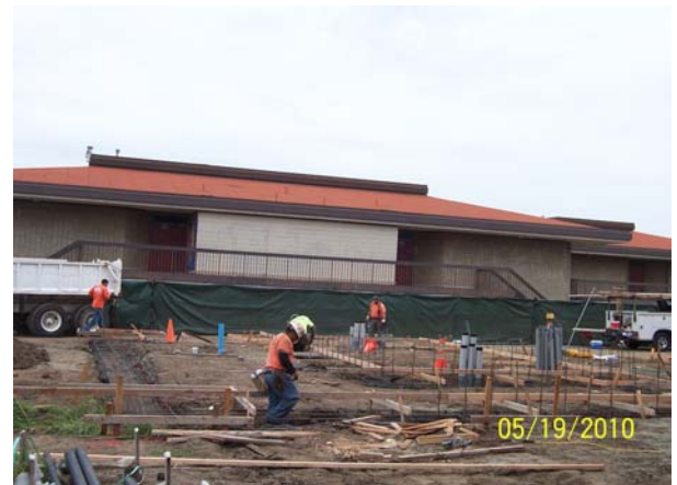
Site: Rebar for Trash & Electrical Enclosure