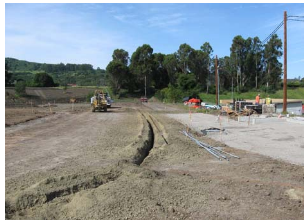
New Irrigation System Trenching