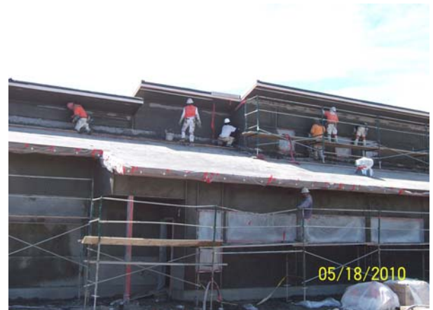
Building A: Stucco - Scratch and Brown Coat