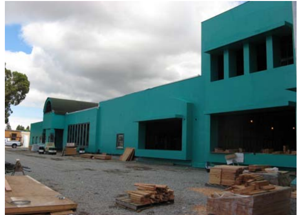
Bldg "A" (North) Waterproof Membrane & "Pop-Outs"