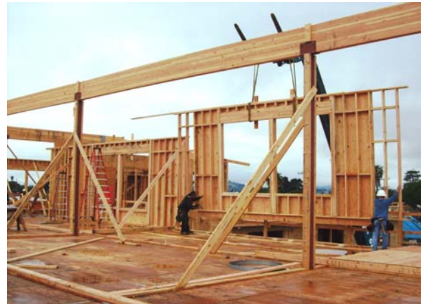
Area A (East); 2nd Floor Exterior Walls Start Going Up