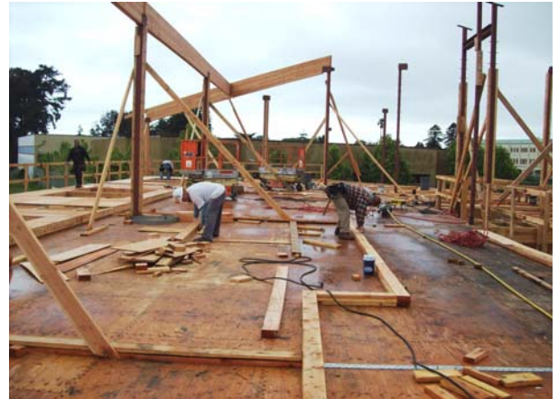
Area A (East); Framing Advances to the 2nd Floor