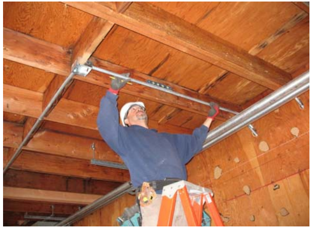
Installing electrical conduit in building A1

Project has fallen behind schedule due to rain and dry out days. General contractor has been notified that he is behind and that he should take necessary steps to recover.