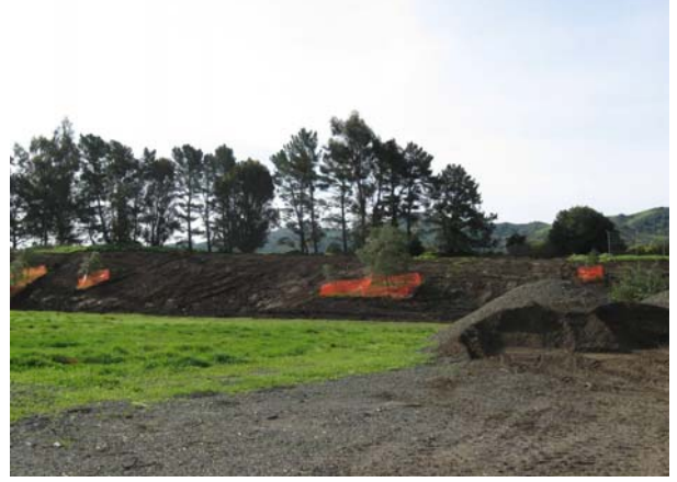
Site Earthwork/Field Layout