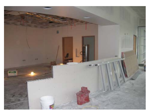
Main Office/ Lobby Area