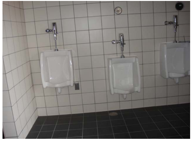
Complete Boy's Cafeteria Bathroom