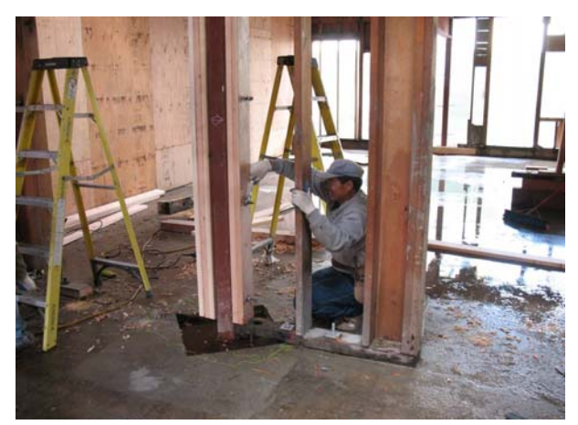
Rough framing at structural beam in building A3