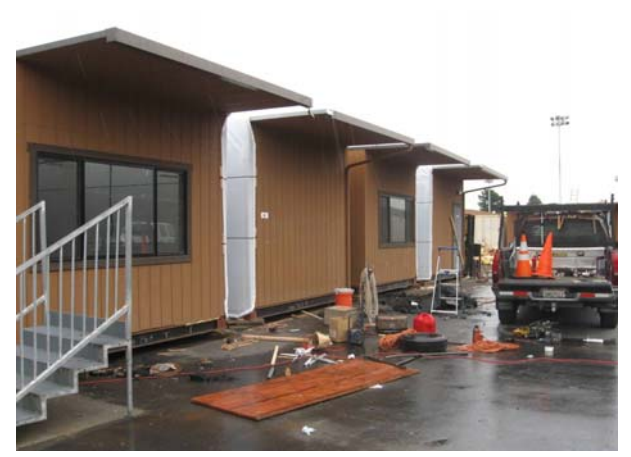
Portables being Prep for Transport