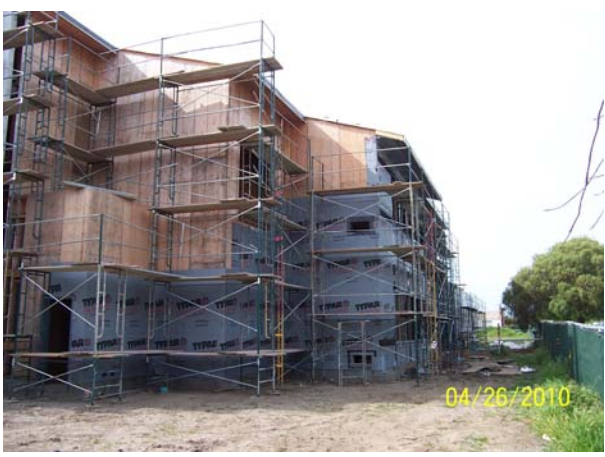
Building B: Metro wrap Building Paper