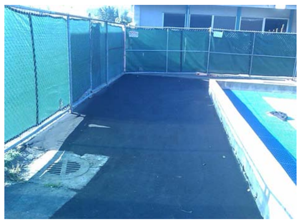
Valley View re-working of paved area