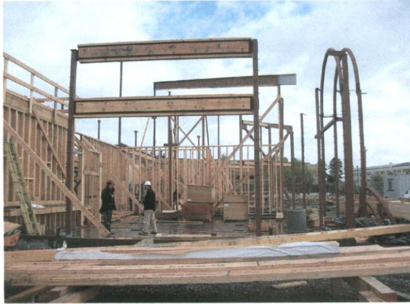
Area A (East); Framing Advances - View to Library