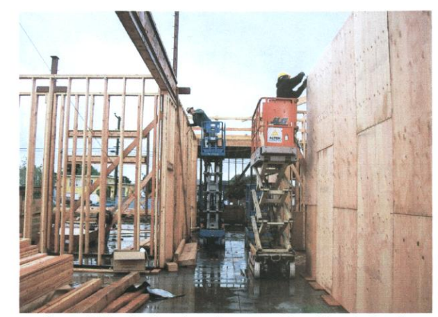
Areas B (East) - Framing along Corridor - View to South