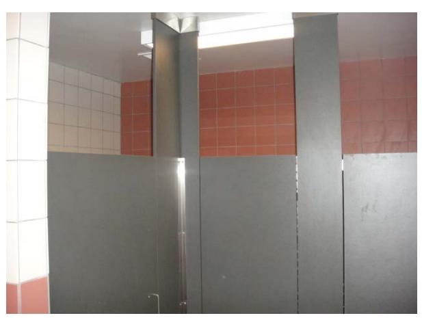
Completed Girl's Cafeteria Bathroom