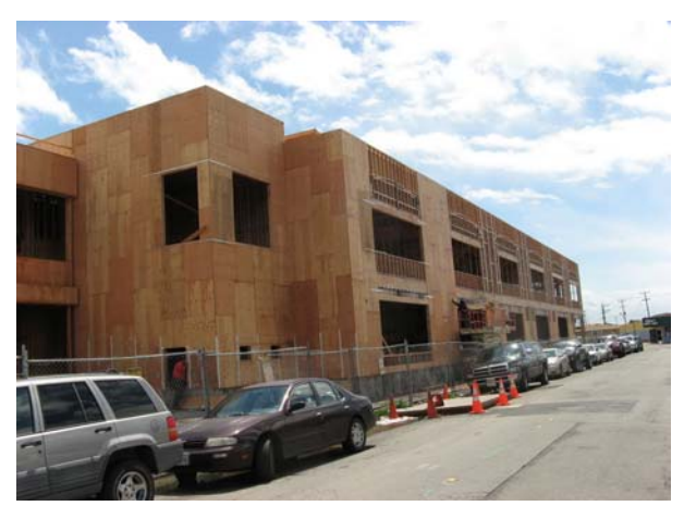
Bldg "A" (South) Installation of Ext. Plywood Sheathing