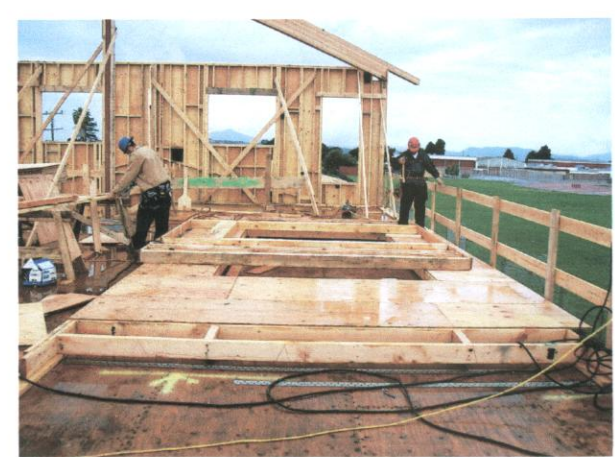
Area A (West); 2nd Floor Exterior Wall Fabrication