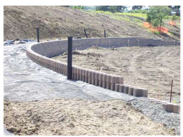
Modular Concrete Retaining Wall Excavation & Backfill