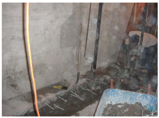
Slab Demo. Coach's Bathrrom