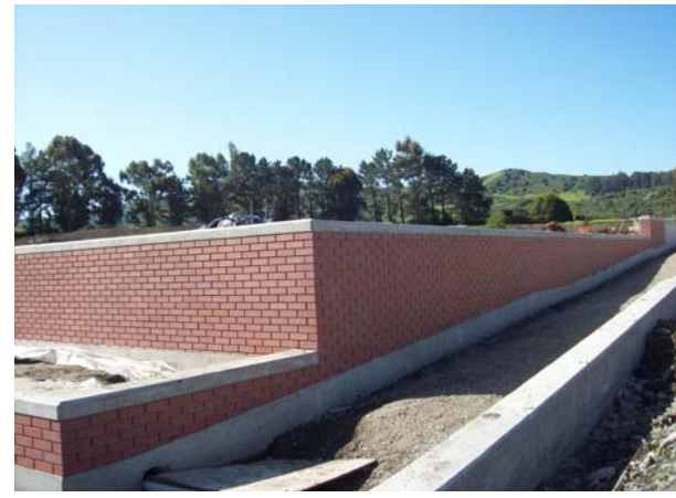
Installation of Brick Veneer at Concrete Retaining Wall