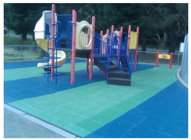
Ellerhorst Play Yard @ 100% Complete