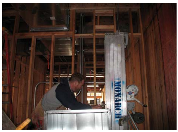
Mechanical installing in building A1