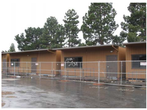
Pedestrian Walkway / Temporary Fence