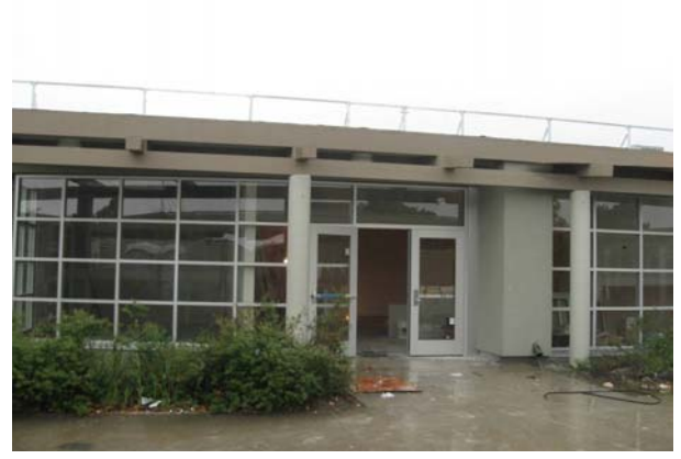
Storefront Windows & Doors at Main Entry

Project is progressing successfully and is on schedule