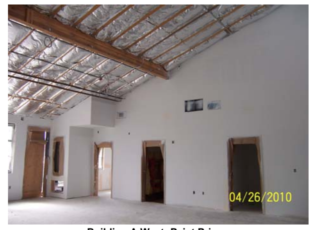
Building A West: Paint Primer