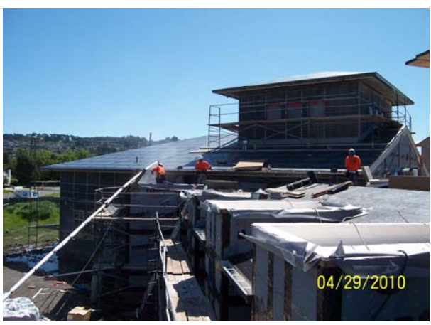
Building A East: Low Slope Roof Installation