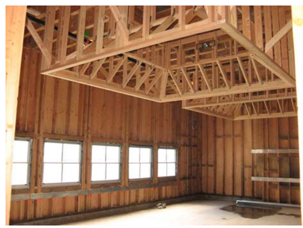
Bldg "A" (North) Installation Window Assembly & Skylite Frame