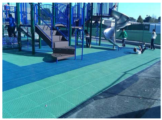
Highland A @ 100% Complete