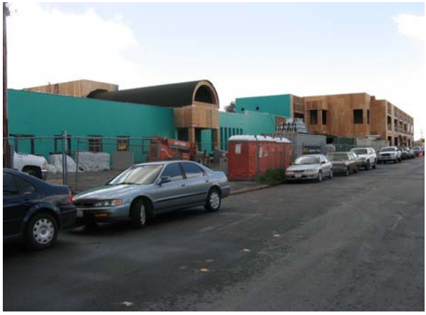
Bldg "A" (North) Application of Waterproof Membrane