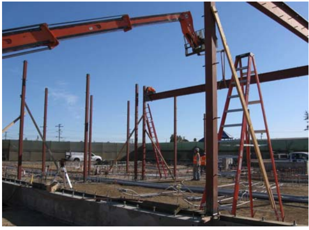
Erect Steel at North End