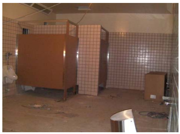
C Bldg- Boys Restroom: Partitions & Fixtures