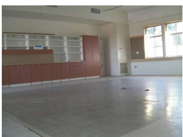
Bldg C1: Installation of VCT Flooring