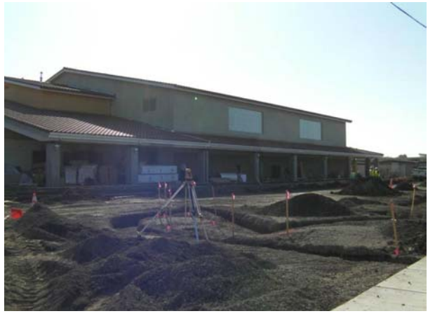
Visitor Parking Lot: Curbs poured & dug