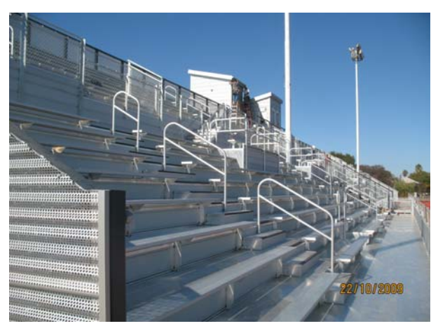
Bleacher seating, stairs and handrails complete