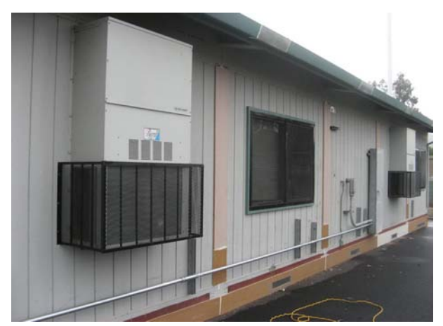
Installation (N) Protective Screens-COMPLETED