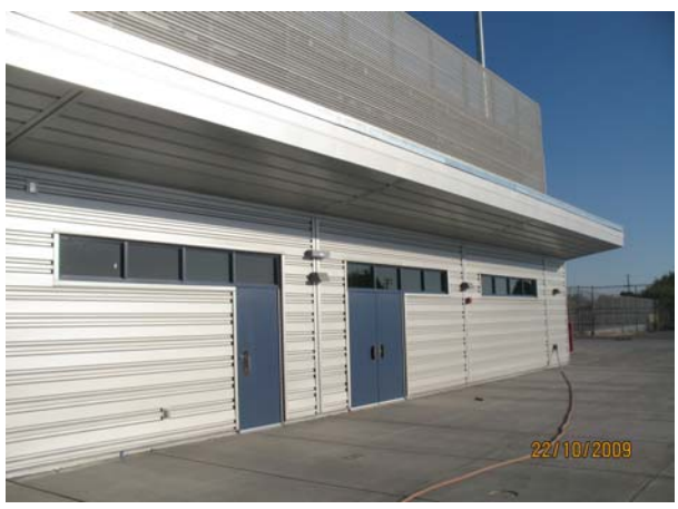
Completed exterior metal siding