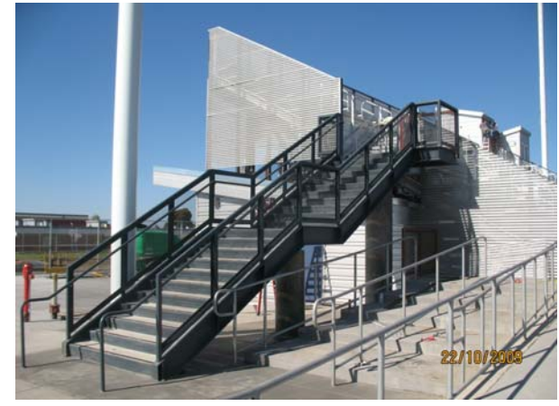
Main egress stairs poured and completed

Construction activity is nearing completion. Punch list activity has begun. The final finishes are underway. Bleacher handrails, stairs and benches installed