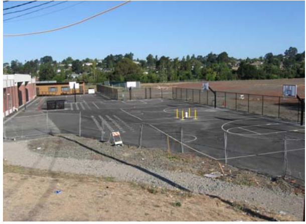
Application of Anti-Graffiti Application-COMPLETED