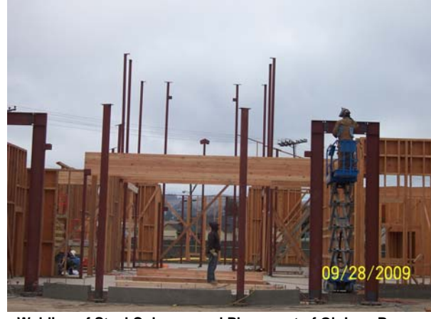
Welding of Steel Columns and Placement of GluLam Beams

• Two (2) adverse weather days this period.