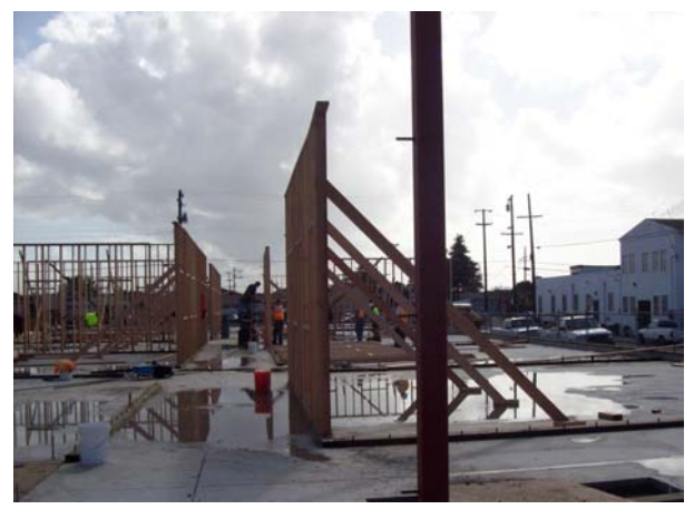
Construction of Interior Wall Framing at South End