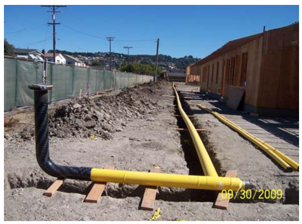
Gas Line at Building Perimeter