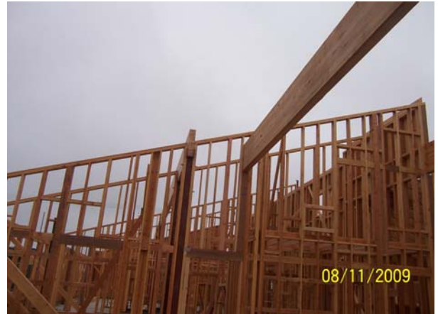
Building A West - Tube Steel and GluLam Beams at Roof