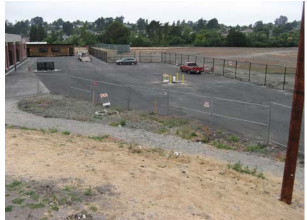
Installation of (N) Fence & Vehicular Gate-95 % COMPLETED