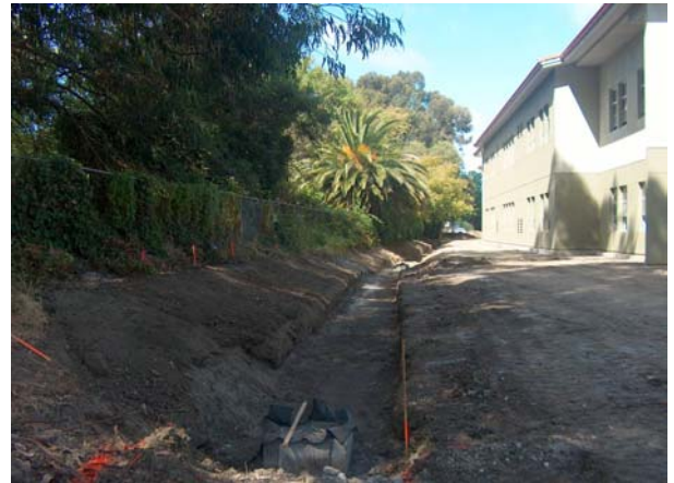
Bioswale @ rear of Building C.