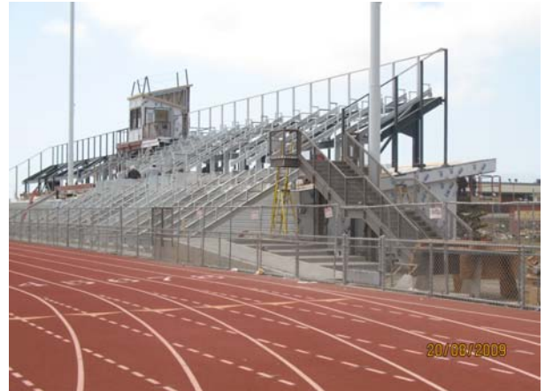
New bleacher stringers installed on main structure.