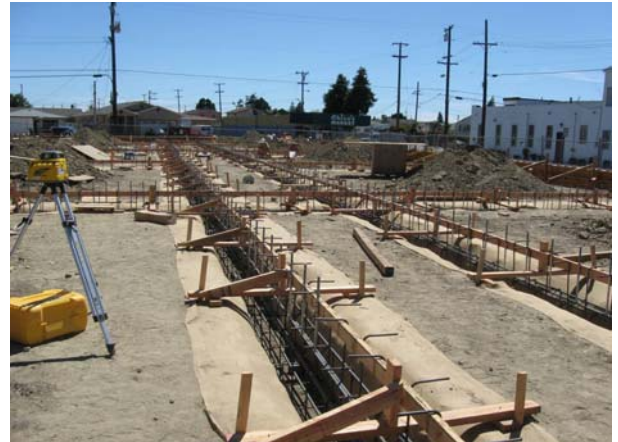
Installation of Footing Rebar at South End