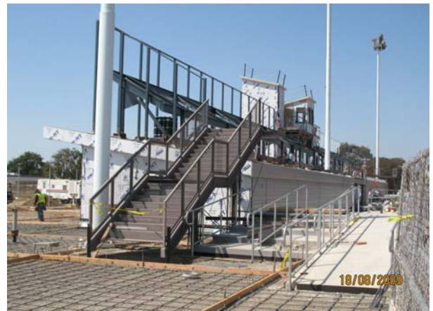
New steel stairs for the upper level bleacher access