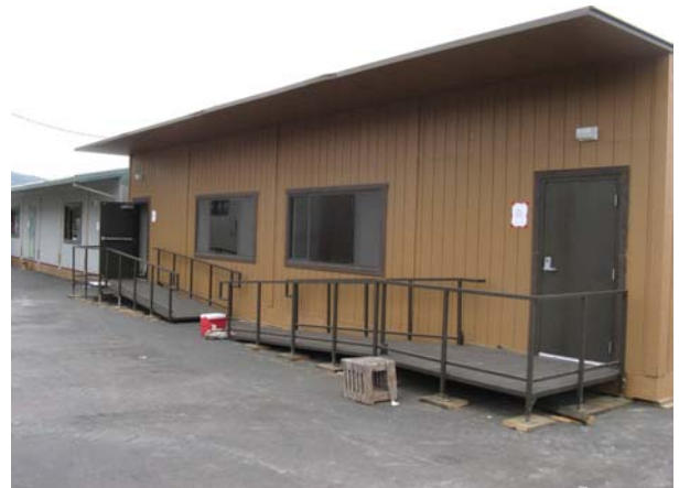
Installation of Ramps in Modular Units-85% COMPLETED