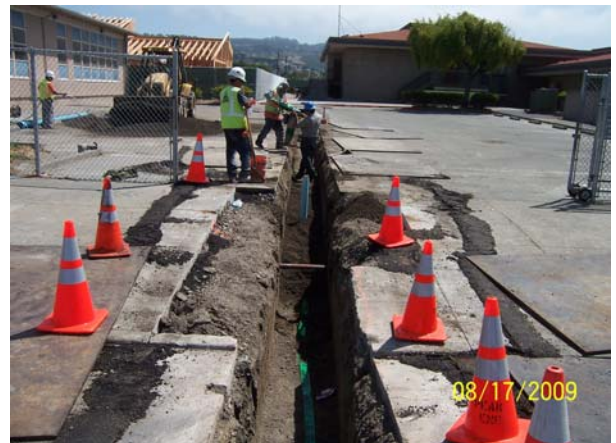
Staff Parking Lot - Storm Drain Installation and Backfill