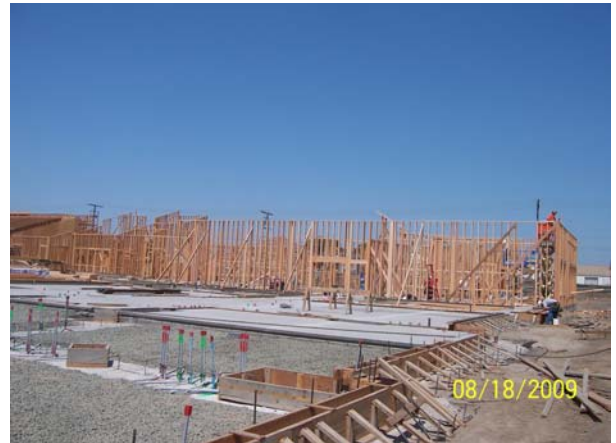
Building A East - Framing