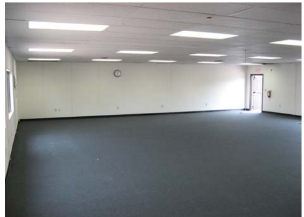
Electrical Infrastructure in Modular Units-90% COMPLETED