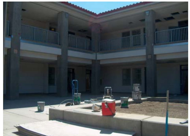
Building C1: Plaster of Exterior Soffits