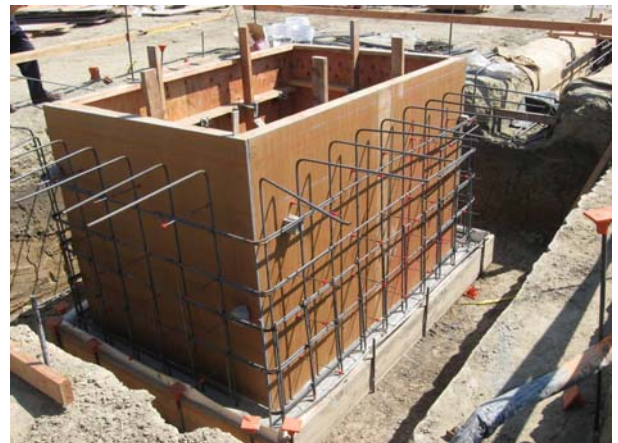
Installation of Elevator Pit Formwork