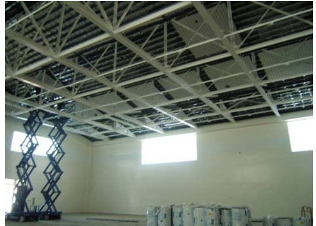
Building G: Installation of Ceiling Panels