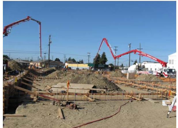
Concrete Pour Stem Walls at South End