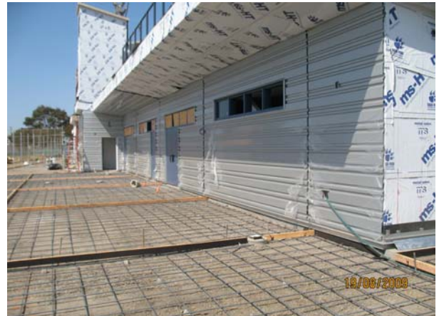
Siding on front wall with patio rebar ready for concrete