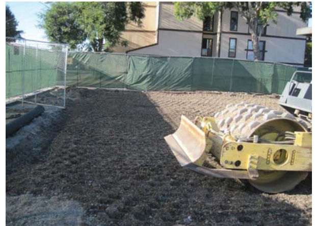
Back-Fill - Compaction