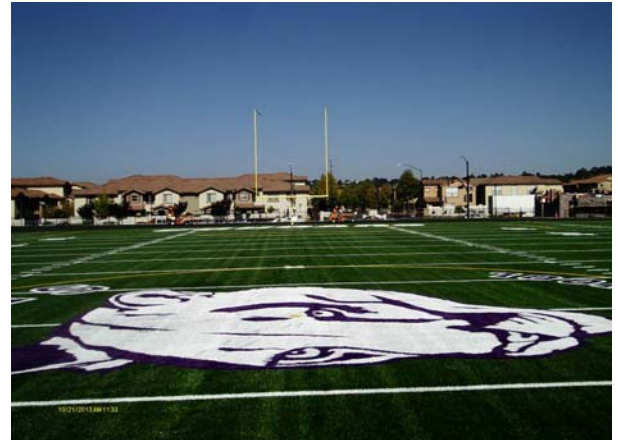
Walter Helms School Cougar logo on synthetic field