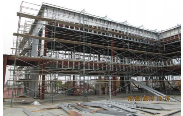
Building A - Metal Decking & Parapet Sheathing