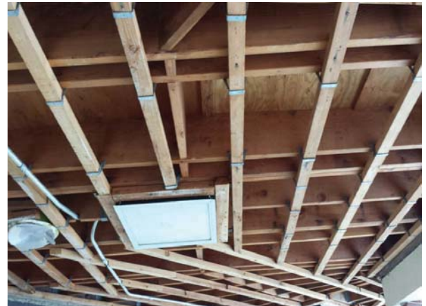
Covered Walkway Ceiling Removal