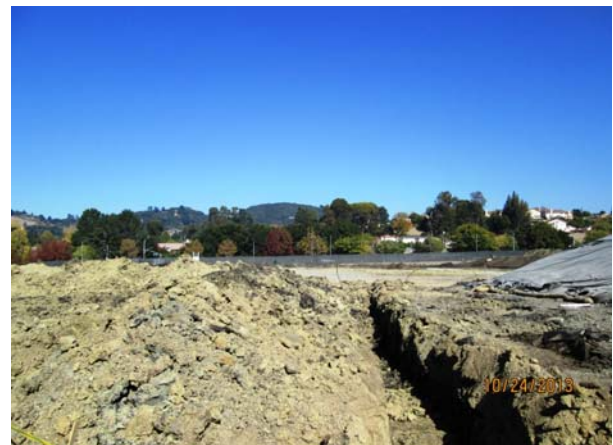
Site Work Existing Utilities Removal