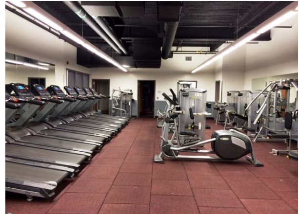
Fitness Room Equipment Installation