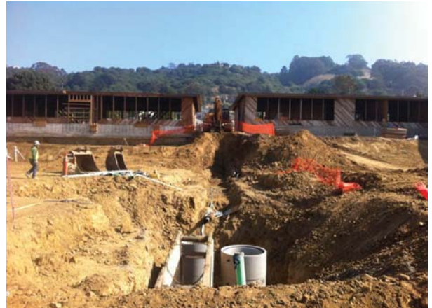
Installation of RWL & SS between Buildings C & B