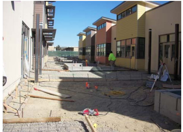
Flatwork Between Buildings A & B