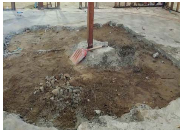
Room 410 Concrete Removal