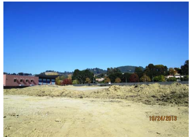
Demolition of Existing Building Slab