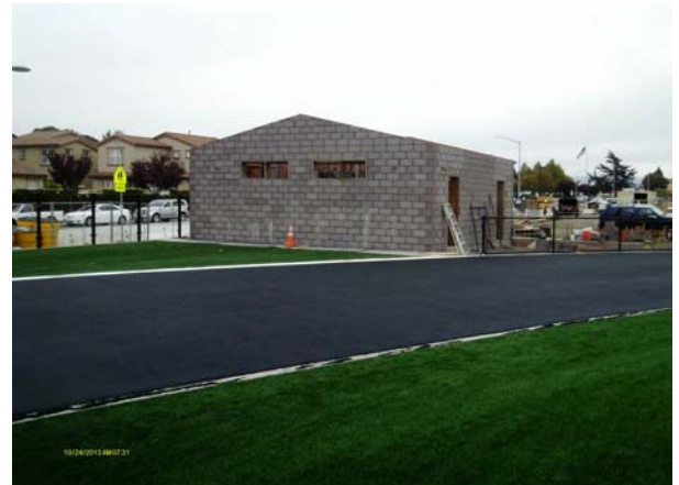
The Concrete Masonry Units installed at Restroom Building