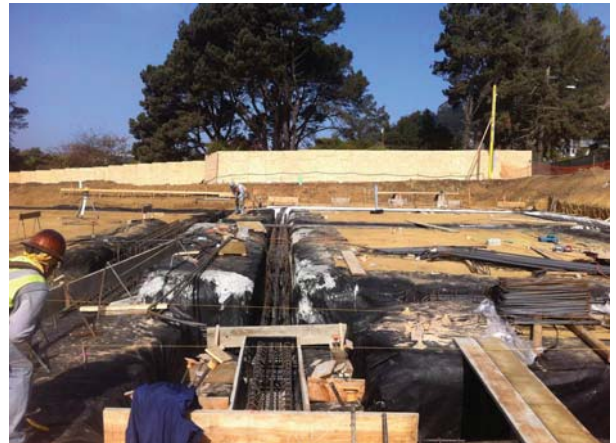
Building D Footings