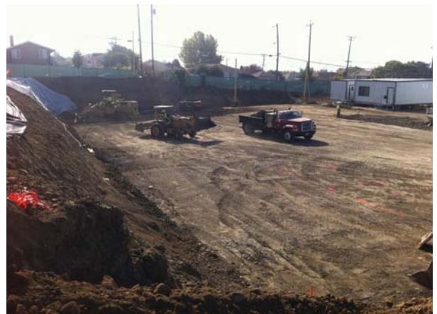
Building B Dewatering & Pad Compaction 95%