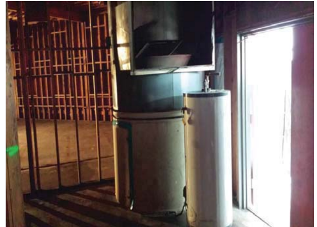
Abated Mechanical Room