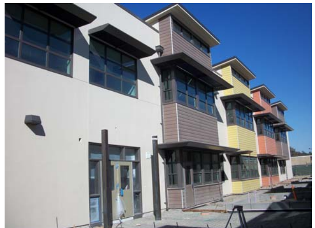
Sunshades on Building A