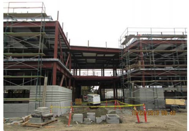
Building C - Scaffolding for Framing & UG Electrical