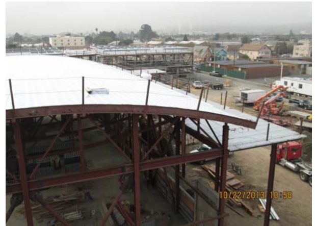
Building B - Roofing