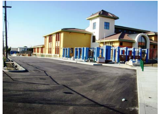
View from Entry to Maricopa Avenue Traffic Turnout