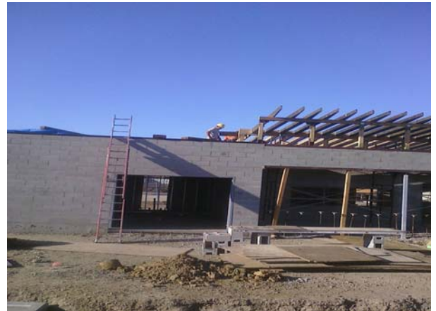
Concession Stand- Roof Framing