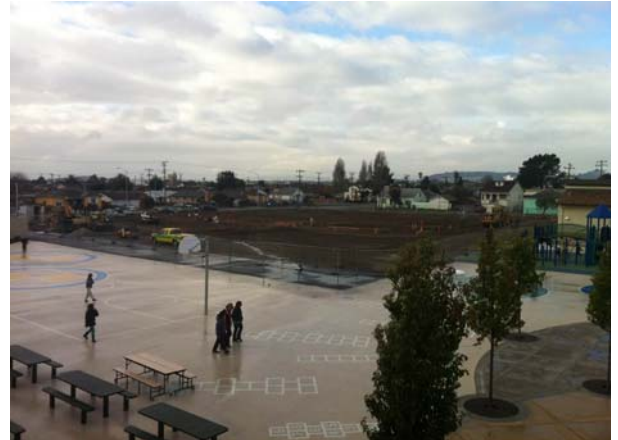
Overall Finish Grade Of Running Track & Play Yard