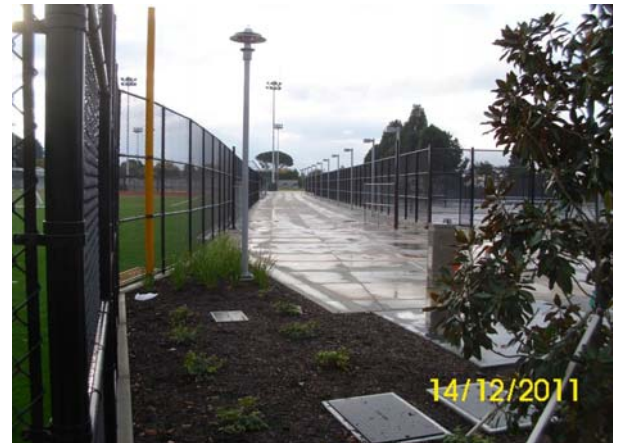
Fire lane/student access to field completed