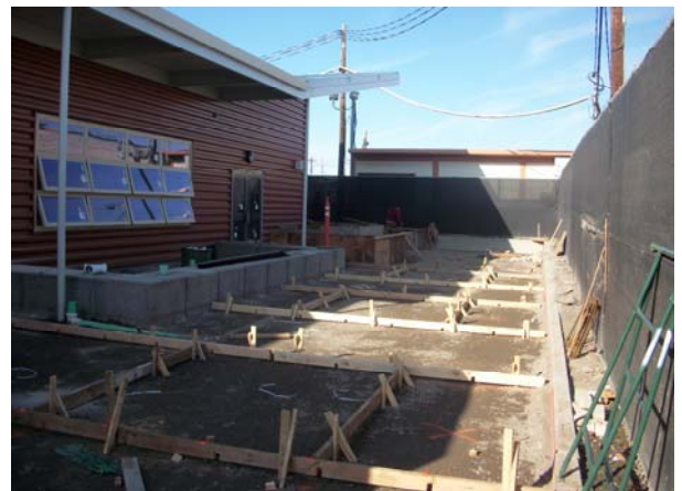
Forming for Flatwork