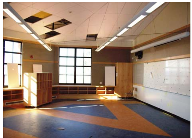
Area A, 2nd Floor North - Multi-Purpose Classroom