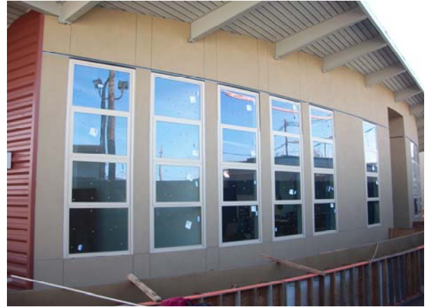
Radius Windows and Stucco Installation