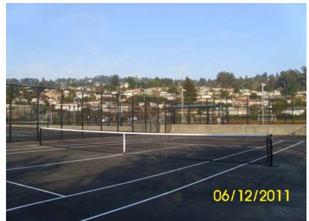
Tennis court temporary striping until warmer weather