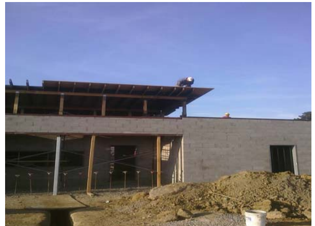
Concession Stand - Roof Plywood Covering