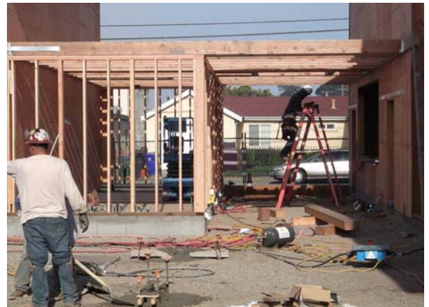
Building B - Construction of Low Roof