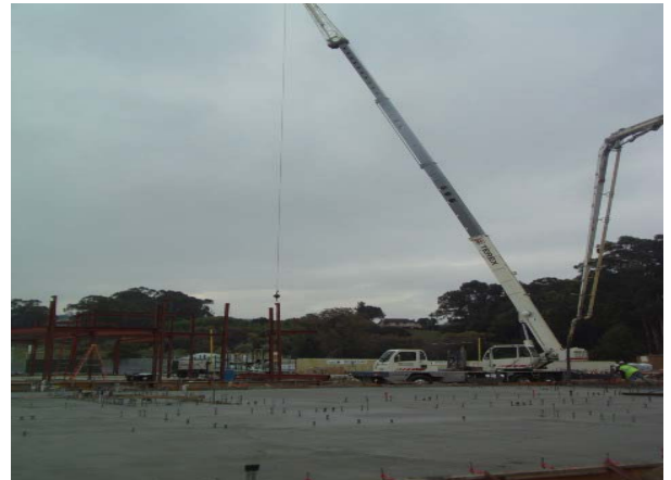
Crane Erecting Steel Columns at Building B