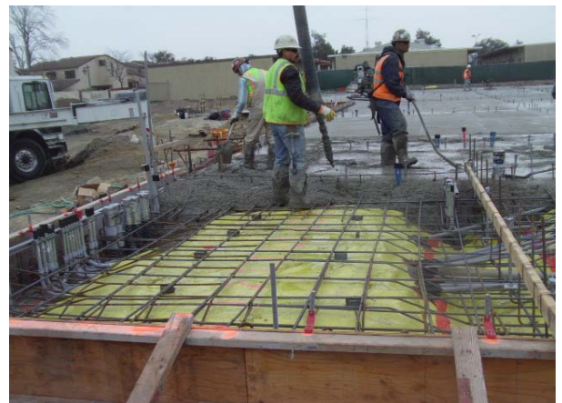
Concrete Pour for Slab on Grade at Building A