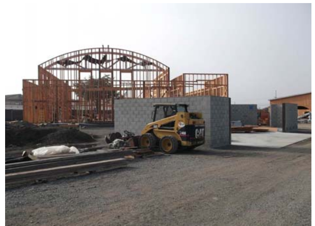
Building C - Framing