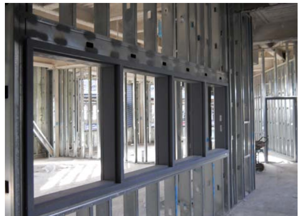
Building 4: Installation of Interior Walls and Windows