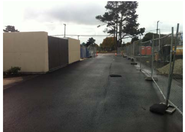
Installation Of Paved Access To Temporary Play Yard