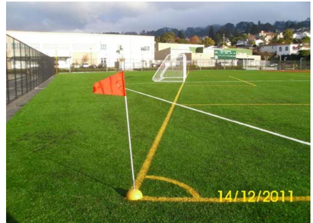
Multipurpose field has been turned over for Soccer team use.