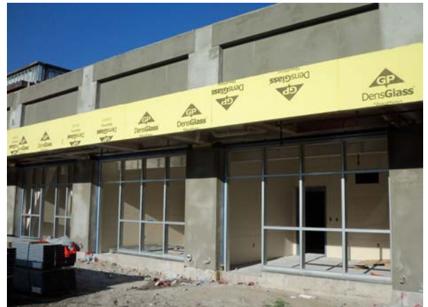
Building 1: Exterior Plaster Applied