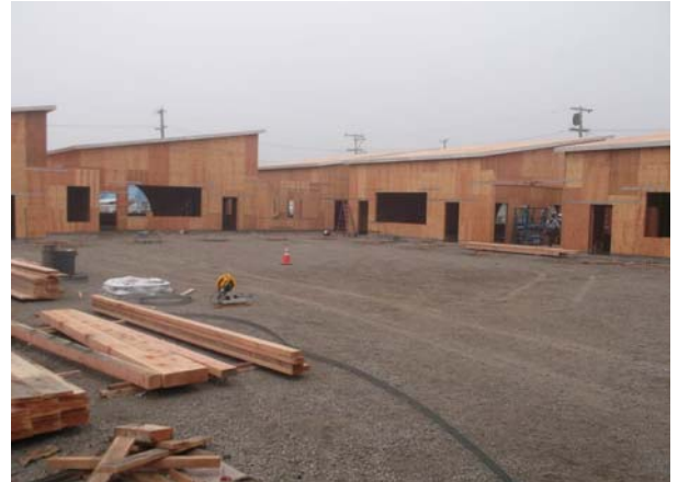
Building B - Shear Panel & Roof