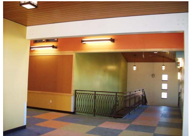
Area B, 2nd Floor East Stairwell Landing