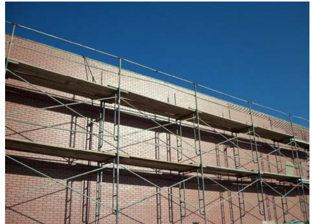
Building 2: Installation of Brick Veneer