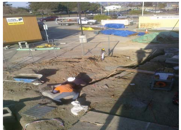
Concession Stand - Catch Basin and Site Drainage Connection