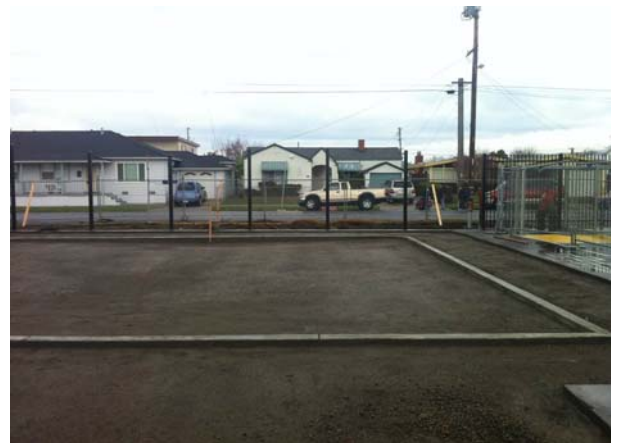
Finish Grade Of Pre-School Play Yard