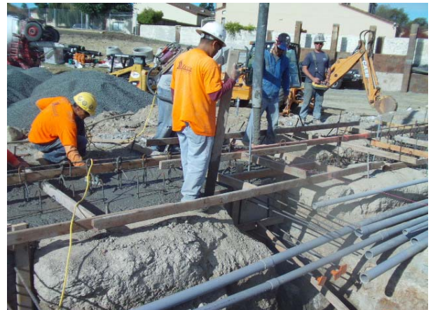
Concrete Pour for Footings at Building A