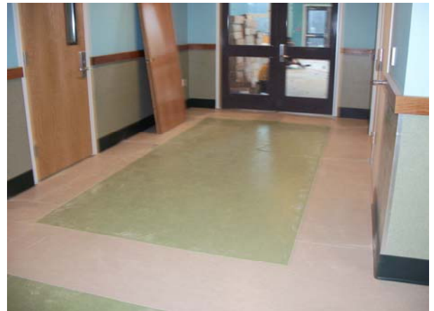
Linoleum Flooring in Hallway