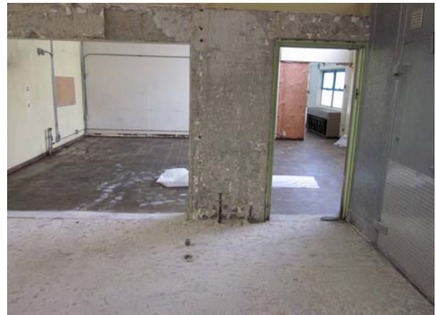
C Bldg - Cafeteria / Kitchen : Abatement Underway