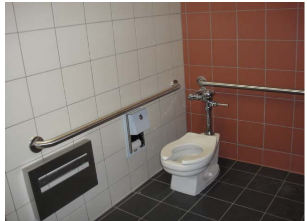
Daycare toilet room