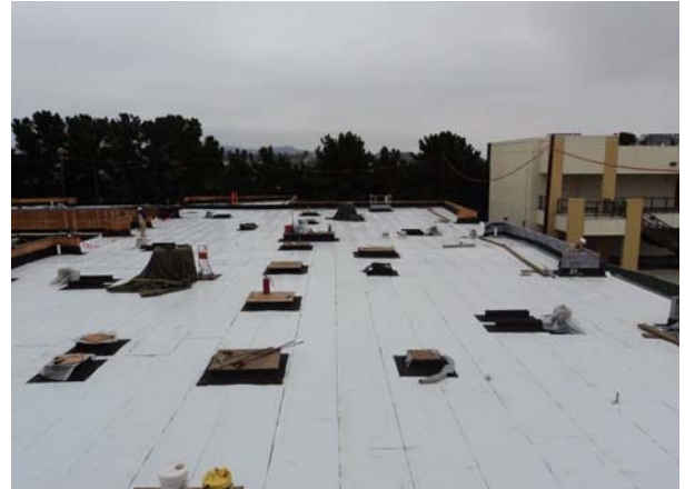
Final layer building A-3 roof.