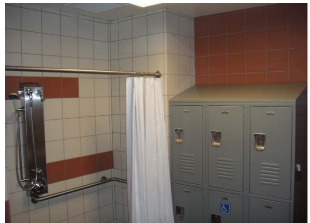
Coaches bathroom shower