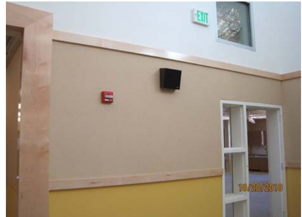
Building A: Wall Coverings with Finishes