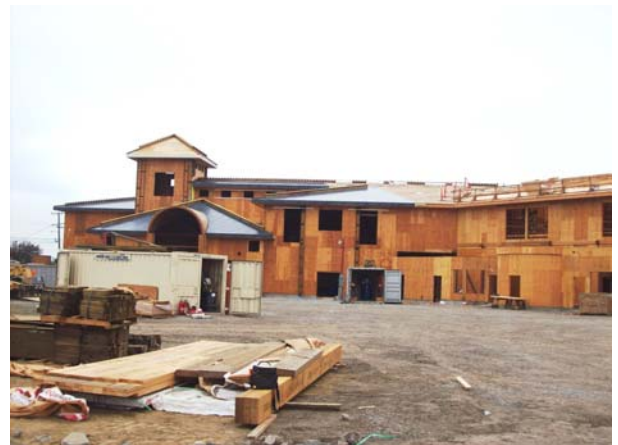
View of Area A & Part of Area B - Looking West