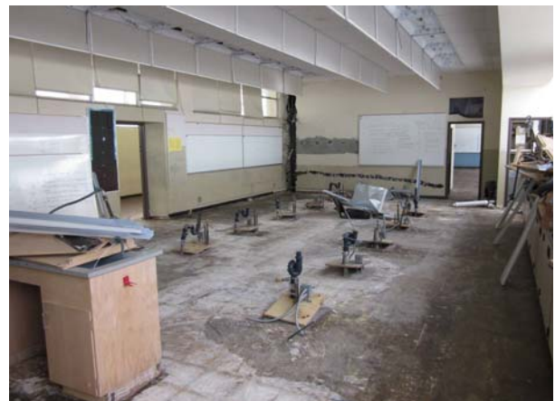
C Bldg - Science Class : Interior Abatement Complete