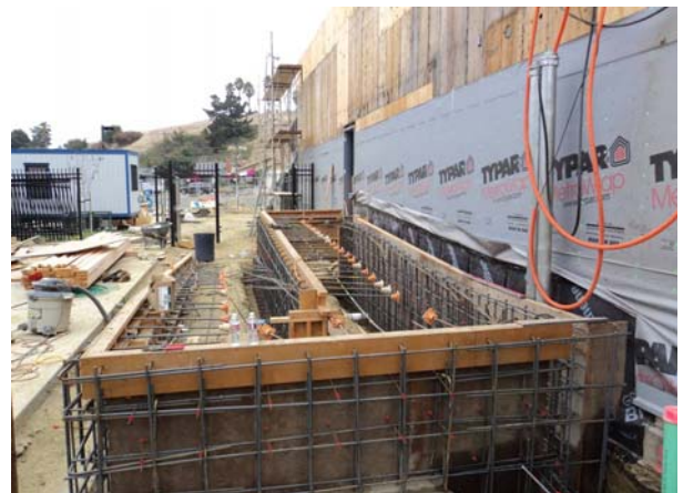
Band Room handicap ramp ready for concrete.