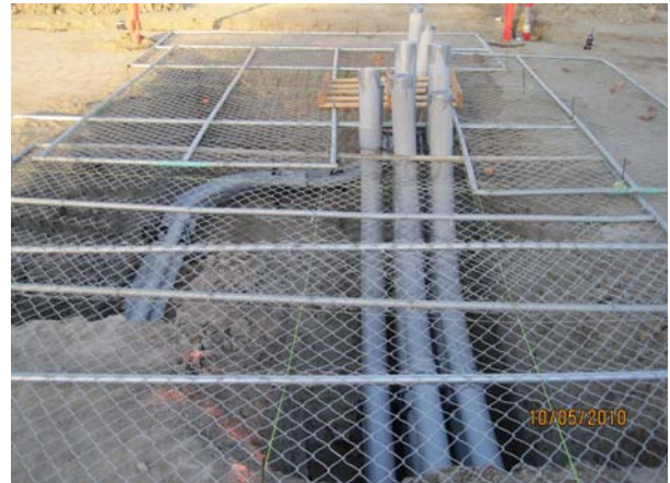
Underground Electrical Conduits