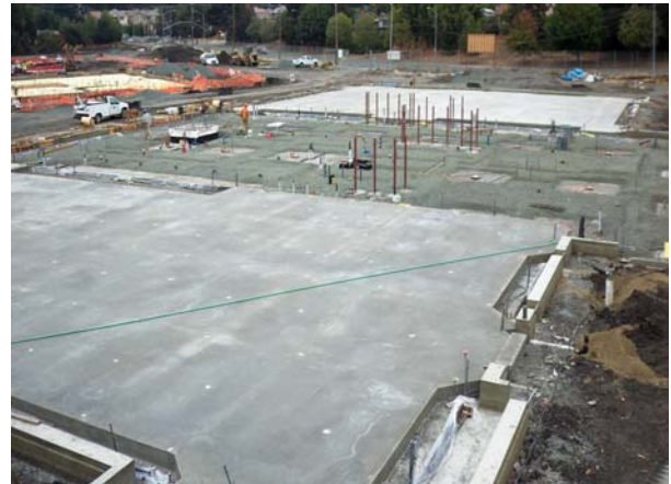
Building 8 Concrete Slab on Grade