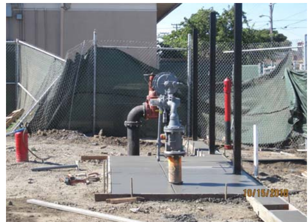
Site: PG&E Gas Meter, Pad & Fencing Posts