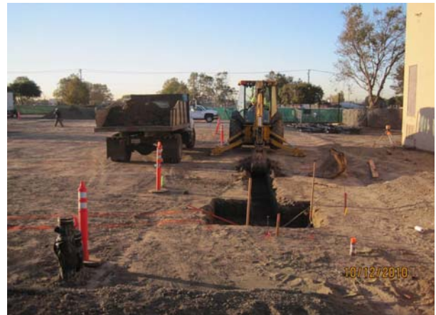
Footing Layout and Excavation