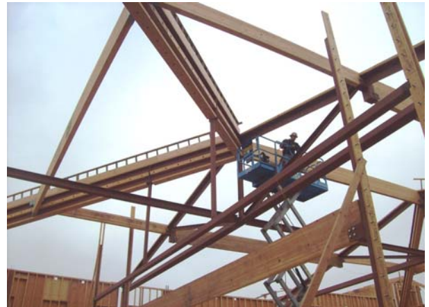
Area C - Roof Construction has Commenced