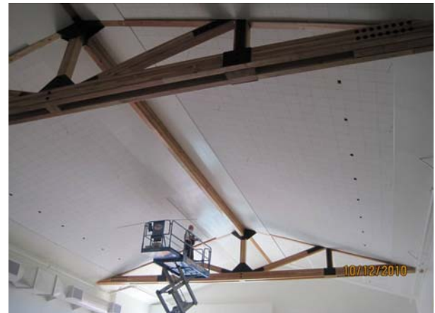
Building C: Ceiling Tiles & Exposed Beams