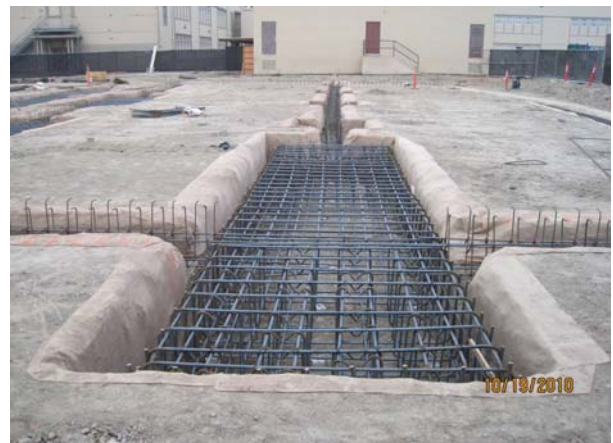
Footing Rebar Cage with Fabric