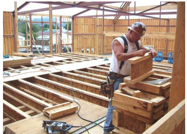
Area C; 2nd floor Construction is underway