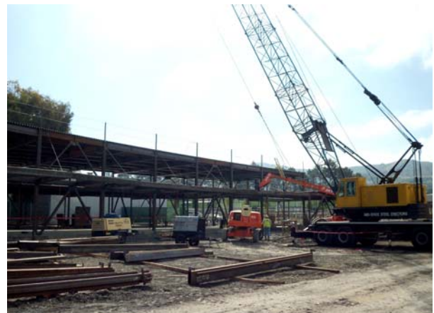
Building 9 Metal Roof Deck Installation