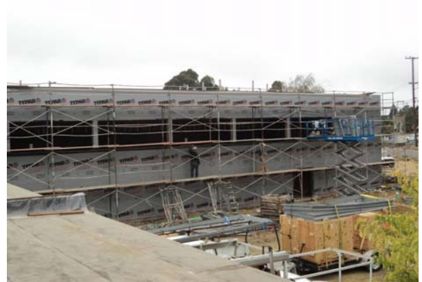
Prepping for Multi purpose room windows