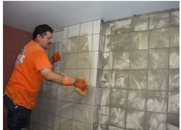
Grout work in coaches bathroom