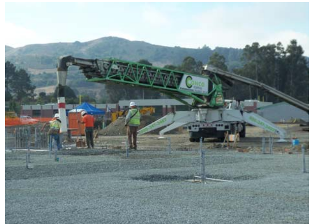
Building 1 Under-Slab Gravel Installation