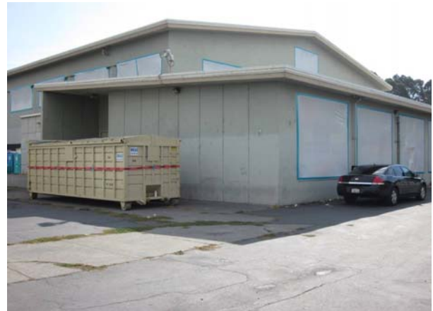
Gymnasium : Containment & Abatement Underway