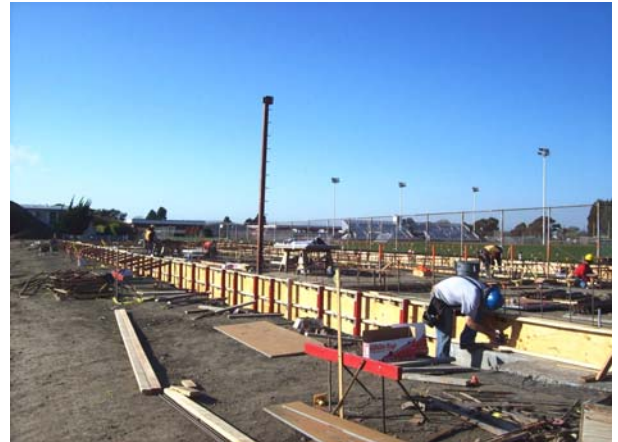
Area A Retaining Wall Form Construction