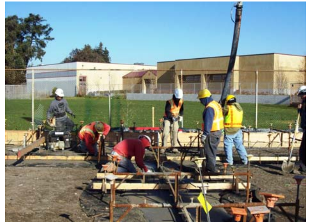
Area A Concrete Placement of Footings & Retaining Wall