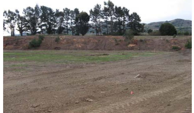
Removal and Clearing of (E) Diseased Trees and Roots