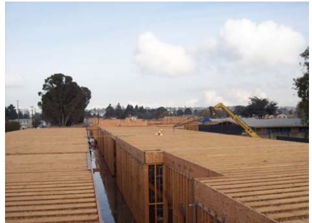
2nd Floor Framing