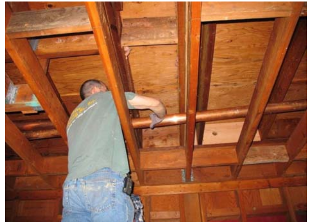
Placing water line in hallway