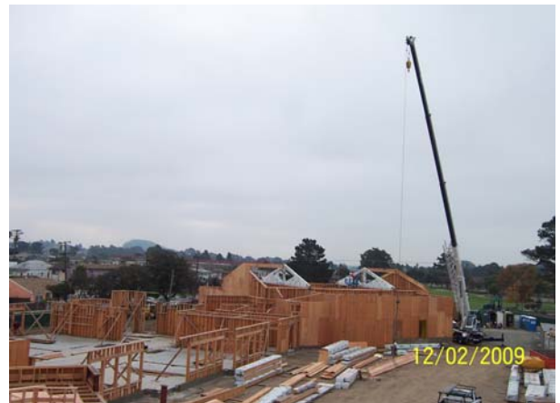
Building C: Set Trusses and Glu-Lam Beams