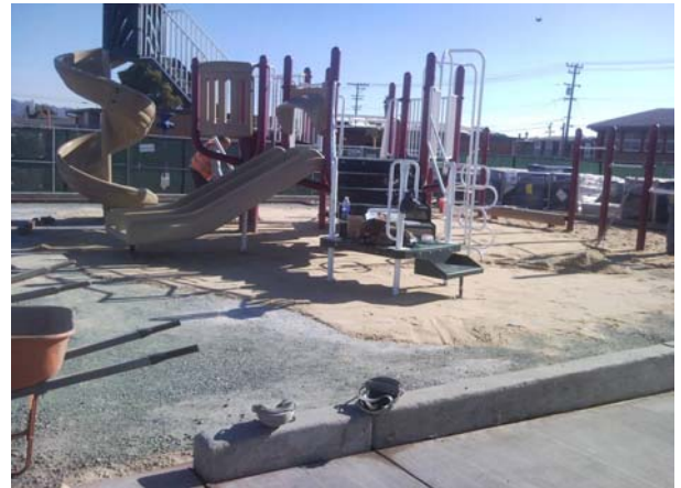
Coronado B Finish Grading before Play Matta Installation