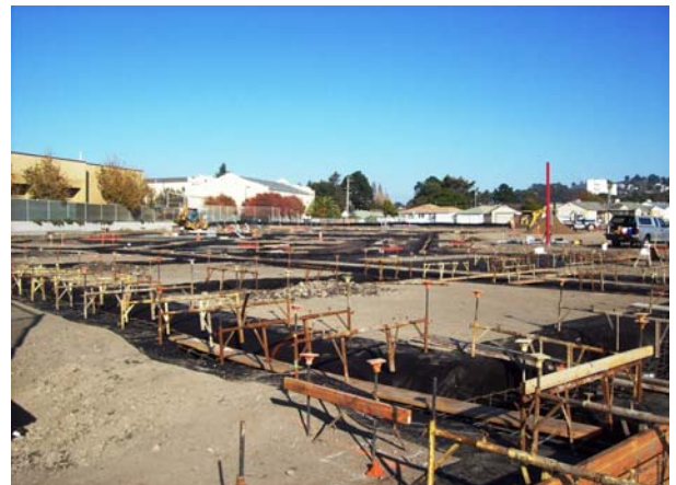
Areas B & C Foundation Construction Progress