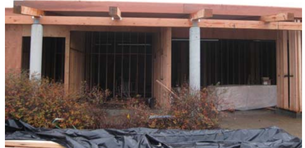
Exterior/Interior Framing at Admin Entry