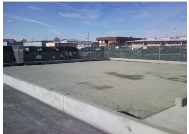
Grant B Finish Grading before Installing New Play Structure