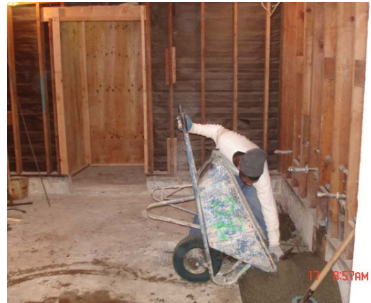
Concrete Pour - Bldg. 700-1 Girl's Restroom