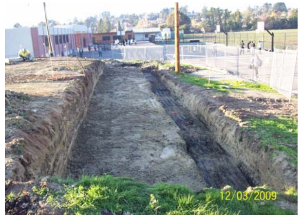
Construction of (N) Baseball Field Retaining Wall Foundation