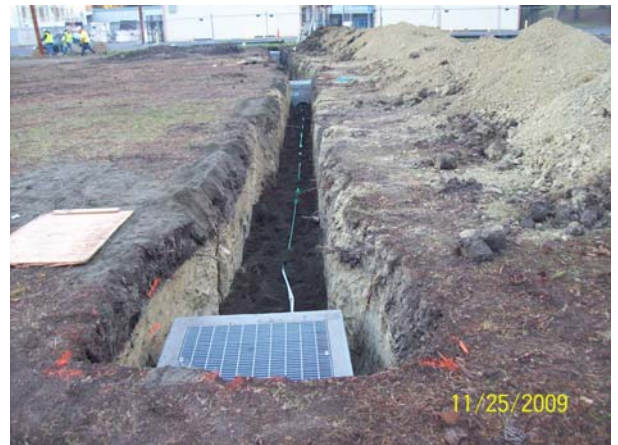
Installation of (N) Baseball Field Storm Drain Infrastructure