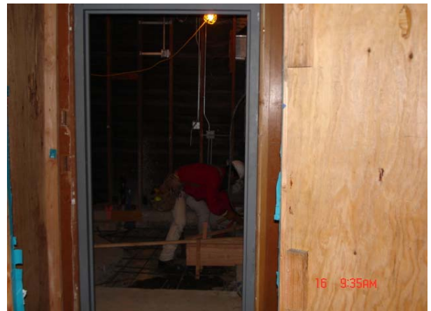
Concrete Forming - Bldg. 800-2 Boy's Restroom