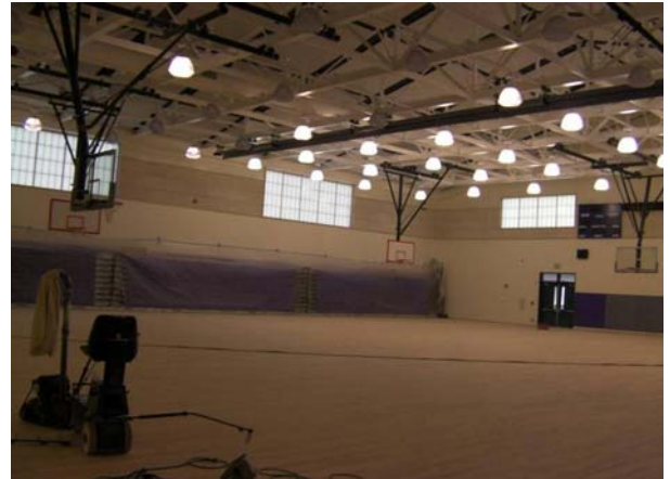
Gym: Sanded Floor, Bleachers & Padded Wall