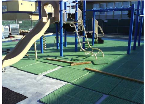
Perez C Play Matta Installation