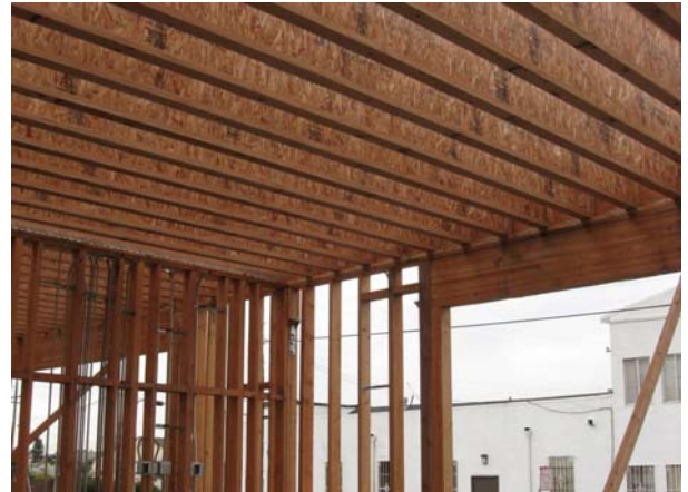
Interior & Exterior Wall Framing