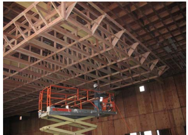
Framing auditorium soffit