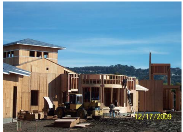
Building A: Waterproof Underlayment & Radius Wall Framing