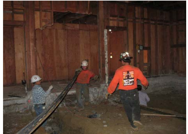
Unloading rebar for interior footings