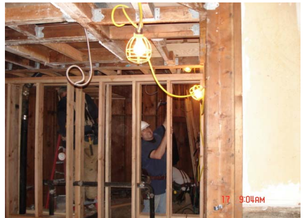
Wood Framing - Bldg. B Restrooms