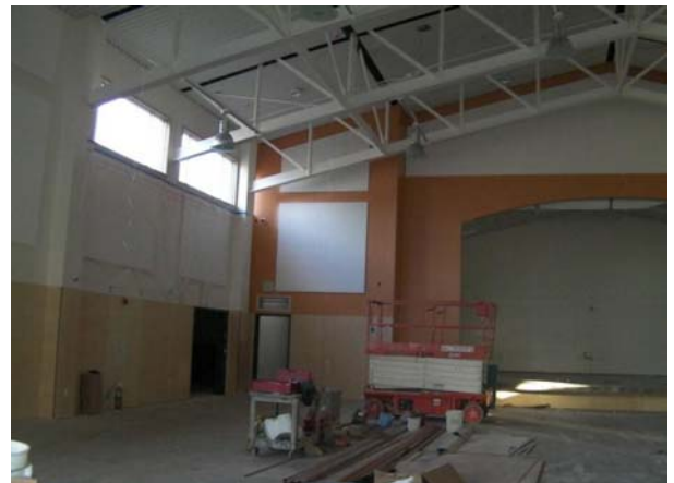
Multi-Purpose Room: Wainscot, Ceiling, Lights.