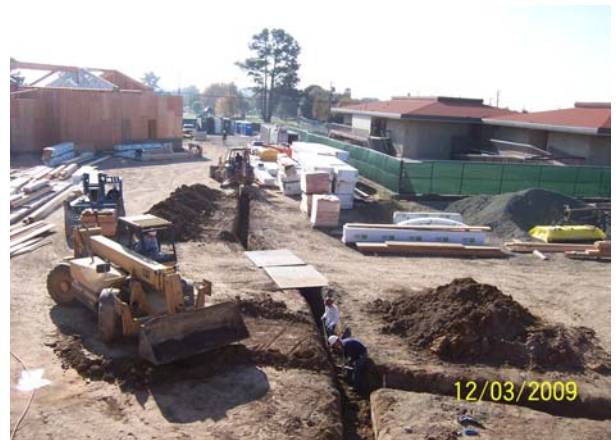
Site: Underground Electrical Conduit Excavation and Install