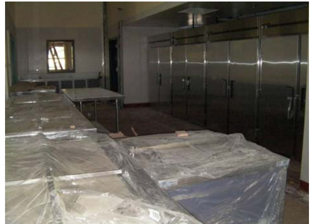
Bldg. M: Kitchen Equipment