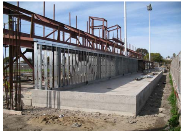
Exterior metal stud framing