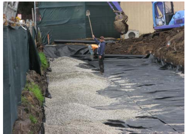
Increment 1A-Installation of Mirafi 140N & Mirafi 600X