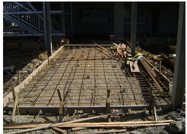
Building C1 Walkway Concrete Formwork and Rebar