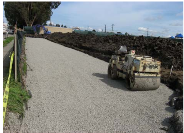
Increment 1A-Installation of 1'-0" of 3/4" crushed rock