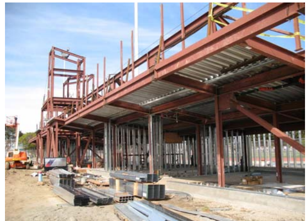
Press box, elevator tower and interior framing