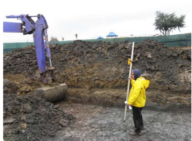
Increment 1A-Over-Excavation Additional 1'-0"