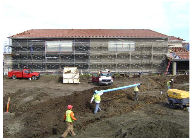
Building G Lath and Plaster