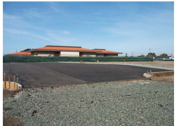
Completed temporary parking lot