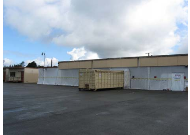
Interior and Exterior Modular Unit Abatement