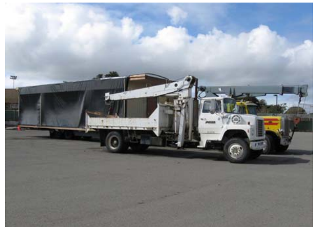
Modular Unit Relocation