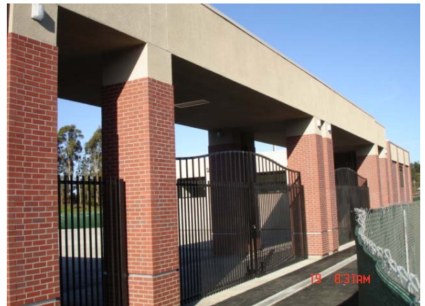
Field House Entrance