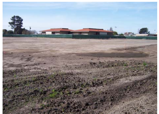
Lime treated building pad