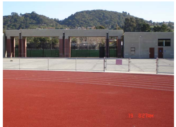
Rear of Field House