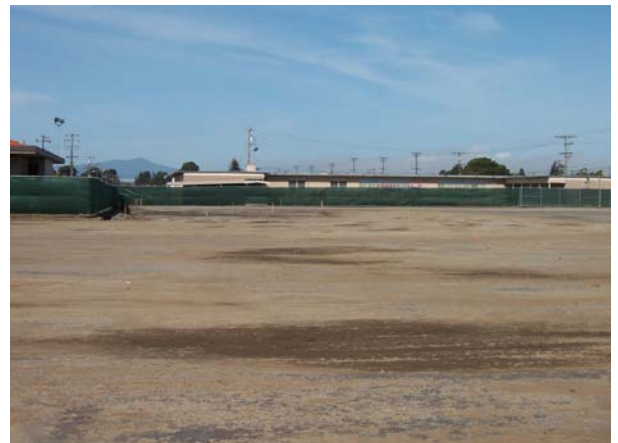
Lime treated building pad