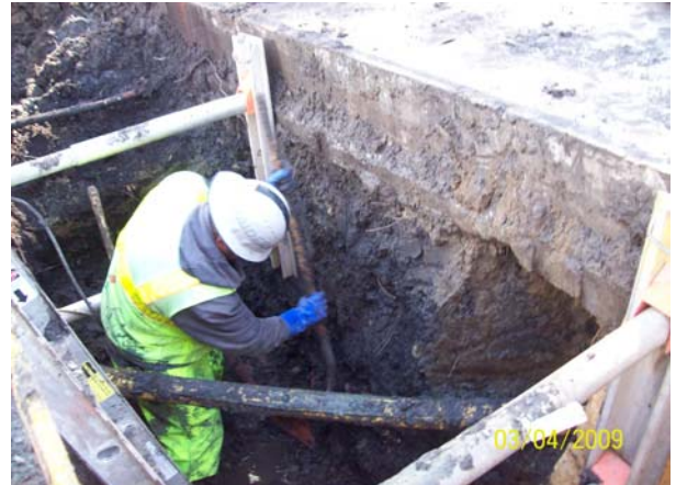
Existing Sewer Line Repair