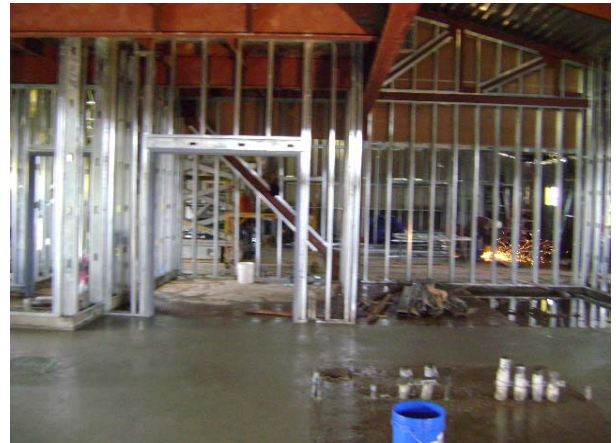
Building M Interior Framing