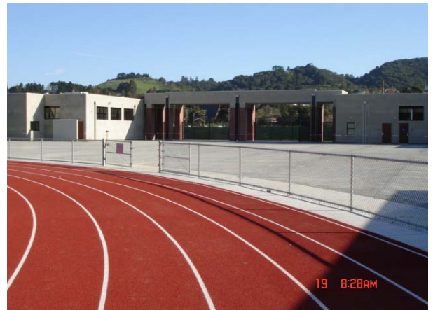
Rear of Field House/Girls Locker Room.