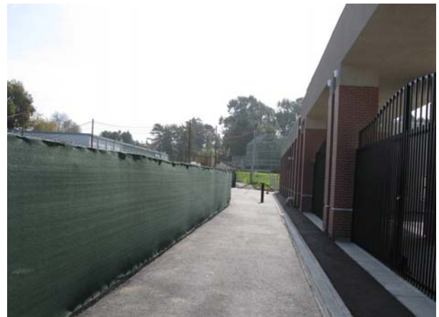
Temporary Walkway Access