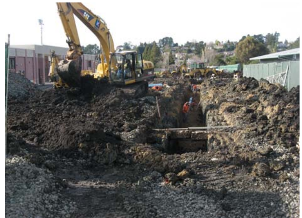
Continuation of Utilities Tie-In to Field House