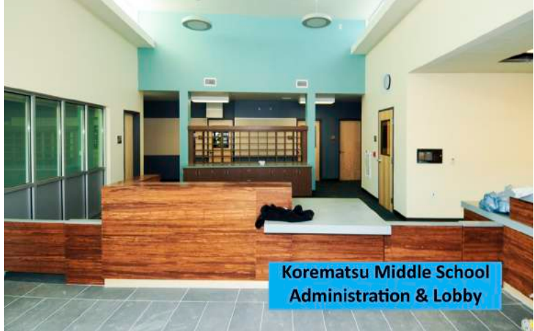
Korematsu Middle School Administration & Lobby

The release of this plan was one of the high points of 2016, something the community was proud of and is looking forward to. But until the WCCUSD re-establishes credibility and trustworthiness in the eyes of many local voters, full implementation of this plan is clearly threatened by a lack of new local bond funding authorizations.