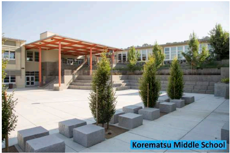
Korematsu Middle School

To measure its progress; to make it transparent to the public; to make sure it is sustained; and to facilitate effective oversight by the CBOC: The Board of Education has approved robust “results and effectiveness” performance audits by Moss Adams LLP, an independent third party auditor with expertise in project management, for the next three years, starting with the fiscal year ending June 30, 2017. And the CBOC has recommended that the scope of these performance audits be expanded to include a review of the implementation of the 112 recommendations from the 2016 “Forensic Accounting Investigation”.