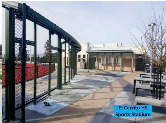
El Cerrito HS Sports Stadium