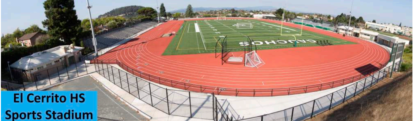
El Cerrito HS Sports Stadium

The State of California requires Citizens' Bond Oversight Committees (CBOCs) to inform the public concerning the expenditures and use of bond funds at least once a year 2 . This is the West Contra Costa Unified School District (WCCUSD) CBOC Annual Report 2016. It concerns WCCUSD's $1.6 billion bond program which began in 1998. This report covers actions and events in calendar year 2016. History prior to that or subsequent events after 2016 are included only as needed to explain and give context to the actions and events described in this report.