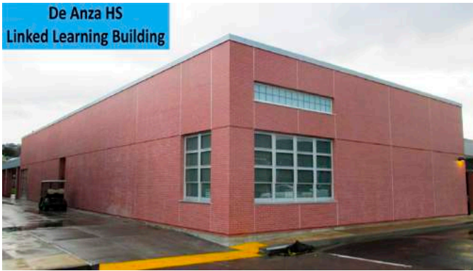
De Anza HS Linked Learning Building