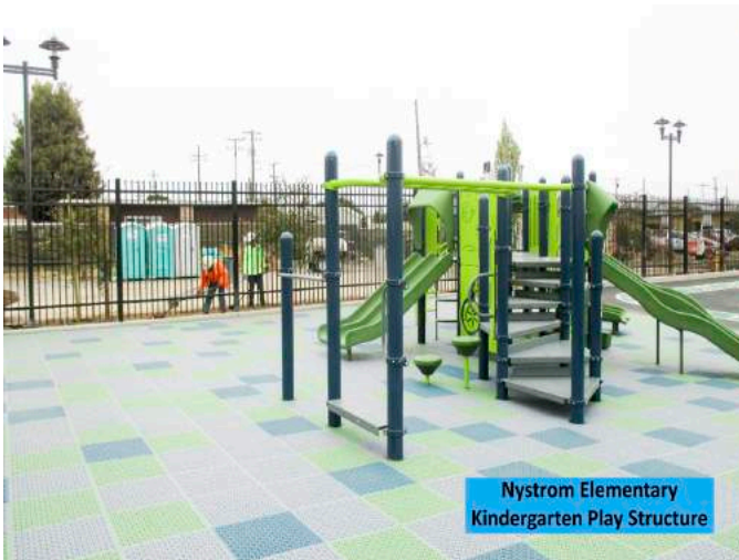
Nystrom Elementary Kindergarten Play Structure

The WCCUSD community began this bond program because it wanted better schools for its students. “What we do, we do for the children!” is how the CBOC tags all of its agendas. This is an important reminder, as all parties work to correct past missteps and re-establish WCCUSD’s credibility. Success depends on a determined effort on the part of the Board of Education, the Superintendent and his Staff and the District’s CBOC. And it will take time. Local voters have stood behind the District in the past. Conceivably they will again once it’s clear the District has gotten itself back on track.